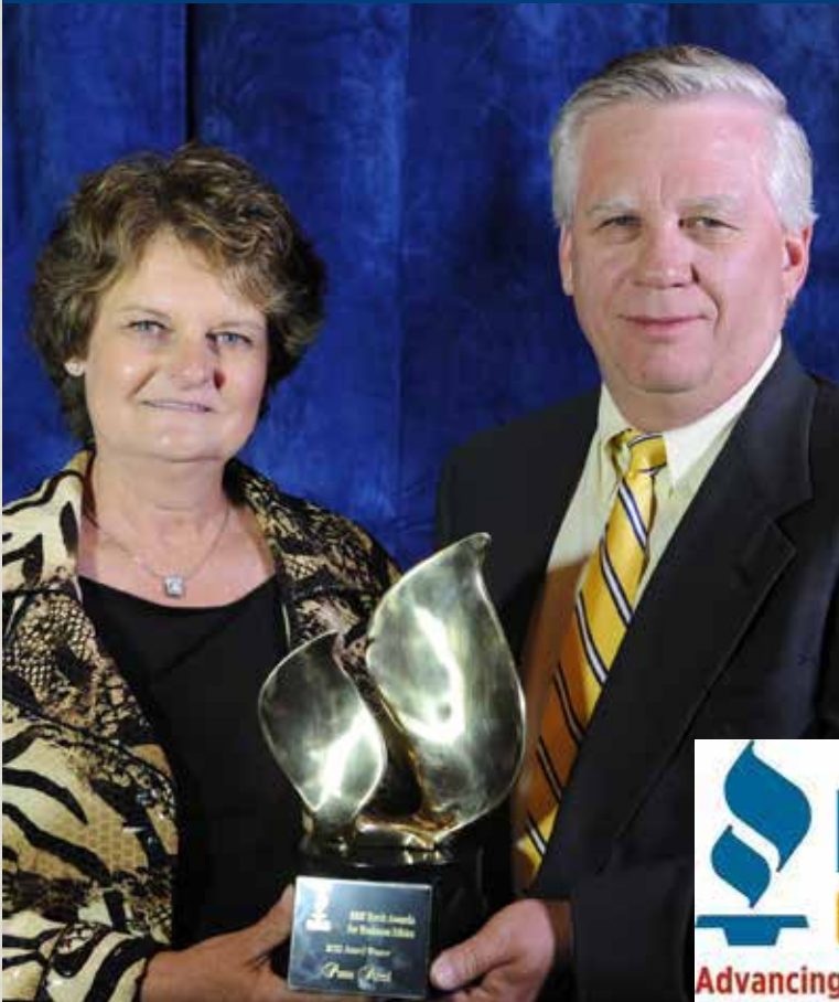
PUMA STEEL OF CHEYENNE