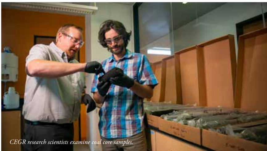
CEGR research scientists examine coal core samples.

U.S.-China Clean Energy Research Center (CERC): CERC is a joint research effort between the U.S. and China. The U.S. membership consists of federal, private, and public sectors and is managed for the DOE by West Virginia University. CEGR has actively worked with CERC partners since 2010. The projects include a joint study to develop a commercial-scale integrated carbon capture utilization and storage demonstration project at Ordos Basin in China. The demonstration project will validate technologies on CO 2 storage and utilization with tight, unconventional reservoirs similar to the Muddy Sandstone in the Powder River Basin (PRB) in Wyoming.