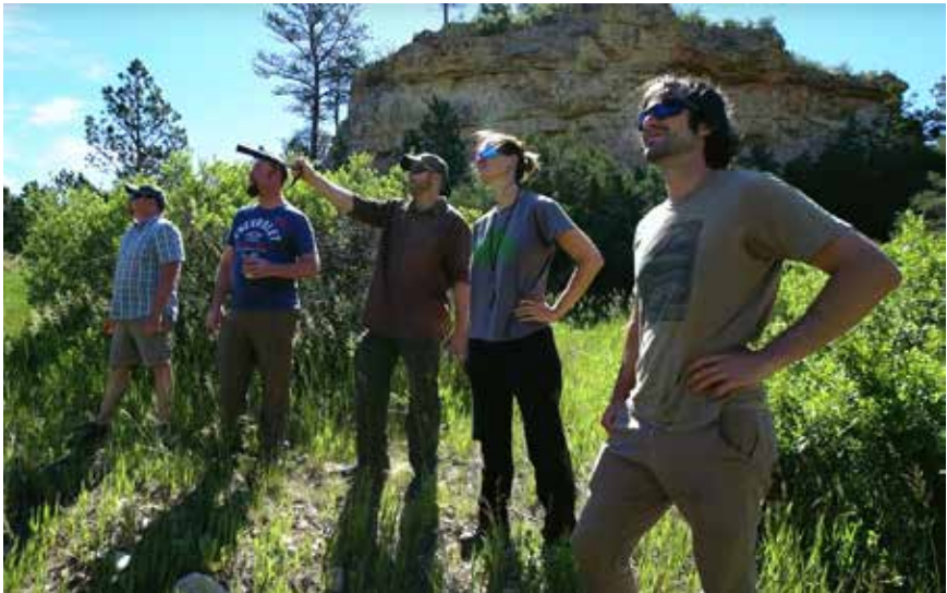
CEGR research scientists use field, laboratory, and modeling techniques to understand the geologic characteristics of the Powder River Basin, which is home to more than 40% of U.S. coal production. CEGR has collaborated with the National Energy Technology Laboratory (NETL) to quantify the region's potential for rare earth element production.

U.S. DOE, 2011, Critical Materilas Strategy, December, 2011, accessed 12/23/2019 https://www.energy.gov/sites/prod/files/DOE_CMS2011_FINAL_Full.pdf