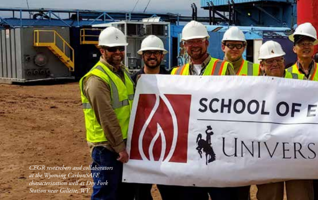
CEGR researchers and collaborators at the Wyoming CarbonSAFE characterization well at Dry Fork Station near Gillette, WY.