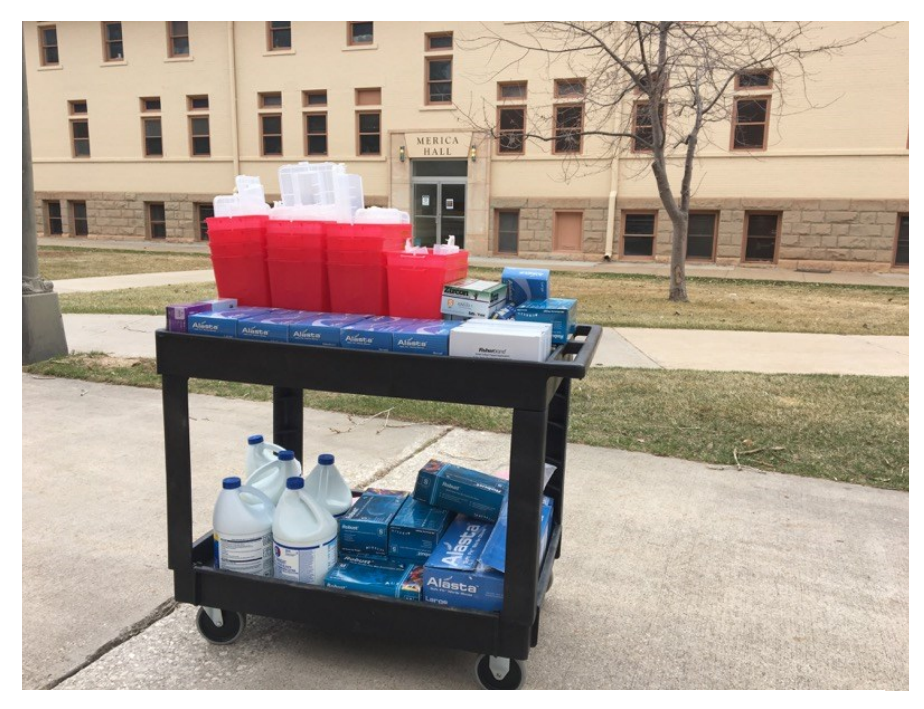
UW Chemical Engineering Department donates supplies from labs to the WTCC.