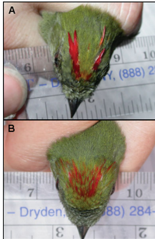
FIG. 2. (A) A young male Long-tailed Manakin in red-cap plumage and (B) a female Long-tailed Manakin with some partly red crown feathers. Note differences in the distribution of red on the crown, the distribution of red on individual feathers, and the length of red crown feathers.

Males in their third basic plumage, which we term “blue-back plumage,” had a mixture of green and black body and flight feathers, a full red crown patch, and some blue feathers on the mantle. Birds in blue-back plumage exhibited the greatest range of variation in proportions of plumage colors, though all exhibited some blue in the back, and some black ventrally. Often, blue-back males had body feathers that were mostly black with a tinge of olive-green and flight feathers that were black with green edging. Some blue-back males had very little green at all in their plumage and might be mistaken for definitive-plumaged males in the field. Other blue-back males had substantial amounts of green in their black body plumage, giving them an almost grayish appearance.