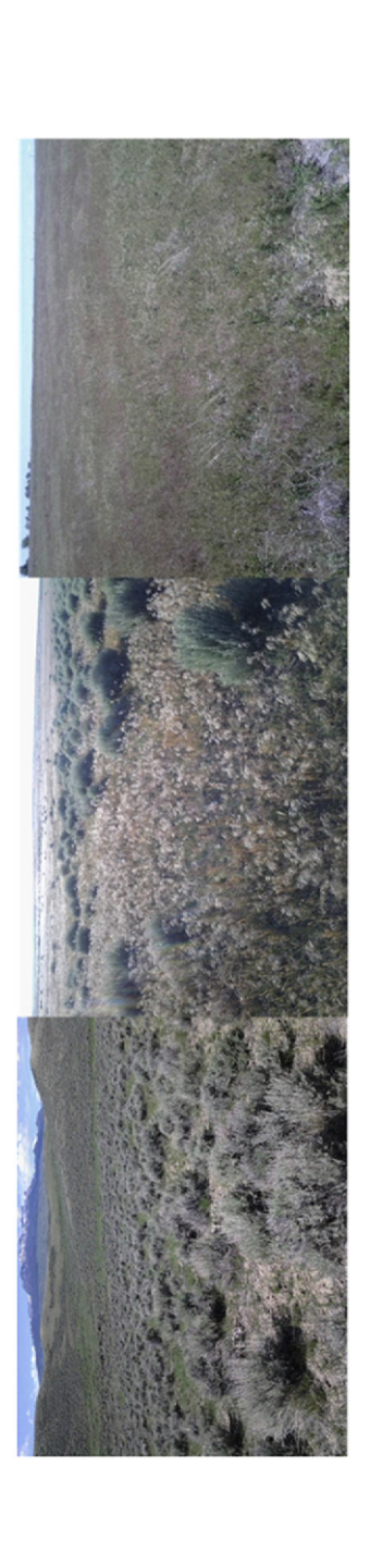
Figure 1. Healthy big sagebrush dominated rangeland (left), sagebrush invaded by cheatgrass (center), and cheatgrass dominated rangeland formerly dominated by sagebrush (right)

Although fire is a natural part of the sagebrush steppe system, invasion of annual grasses has resulted in increased fire frequency in some areas where natural successional processes have not occurred after fire.<sup>7</sup> During natural succession, plants generally resprout from the available seedbank or from seeds that disperse into the disturbed area from nearby unburned patches. Where cheatgrass ( Bromus tectorum ) has invaded, it is likely to become more common in the seedbank as the diversity of native grass, shrub, and forb species decreases (Fig. 1).<sup>7</sup>