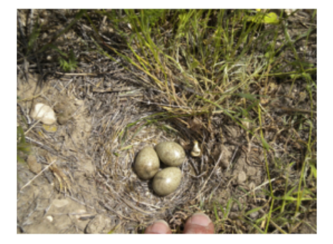
Figure 4. Bird communities adapt to changing landscapes as grass and shrub densities change (Horned lark nest, 29 May 2009, Park Valley UT).

Richness and diversity in the bird community are also affected by conversion of sagebrush to grassland. In addition to the tendency of grasslands to favor a different avian assemblage than sagebrush, the structure and heterogeneity of patches has been shown to affect species assemblages.<sup>17</sup> Researchers in Nevada found that the highest species diversity was found not in undisturbed sagebrush stands, but in crested wheatgrass seedings that had been invaded by sagebrush. Unlike the more