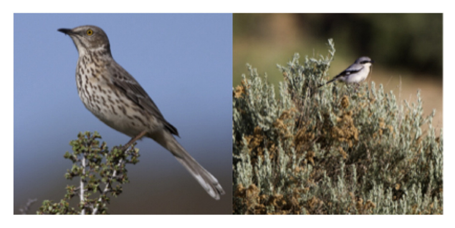
Figure 3. The sage thrasher (left) is considered a sagebrush obligate, while the loggerhead shrike (right) is associated with sagebrush and grasslands.

cheatgrass understory. In areas where smooth brome ( B. inermis ) has invaded, the understory is generally more dense, which may confer a benefit to species nesting in these areas.<sup>20</sup> Compared with areas with an understory comprised mainly of native grasses, Brewer's sparrow nest establishment in areas with a smooth brome understory occurred later and fewer eggs were laid, but overall nest success, as measured by hatched and fledged young, was higher.<sup>20</sup> Earnst and Holmes also reported that predation of nests and fledglings was lower in non-native grass-dominated areas, probably as a result of taller grasses comprising the understory as well as higher overall coverage within the understory.<sup>19</sup>