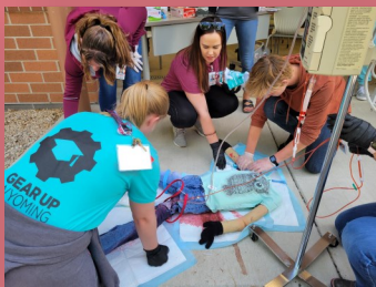
Students learning about studying to become an EMT (Powell, WY)