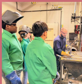
Students learning welding from a Gillette College welding student (Gillette, WY)