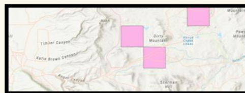
Map 3: Parcels Only Accessible by Corner Crossing