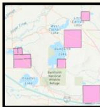
Map 2: Parcels Accessible by Public Roads