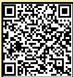
QR Code to ArcGIS Map