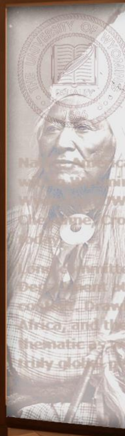
Level One Circular Servery