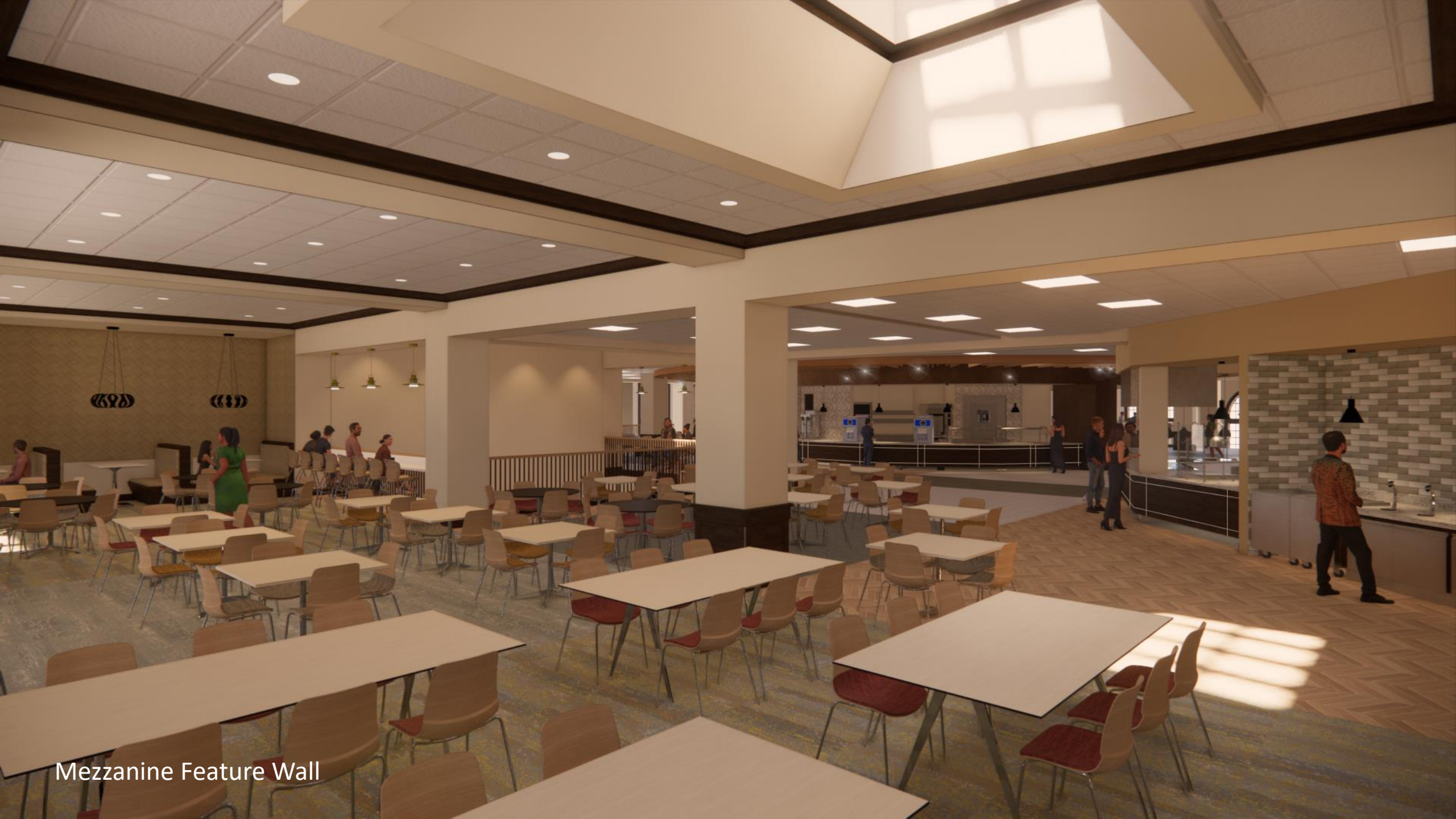
Mezzanine Feature Wall