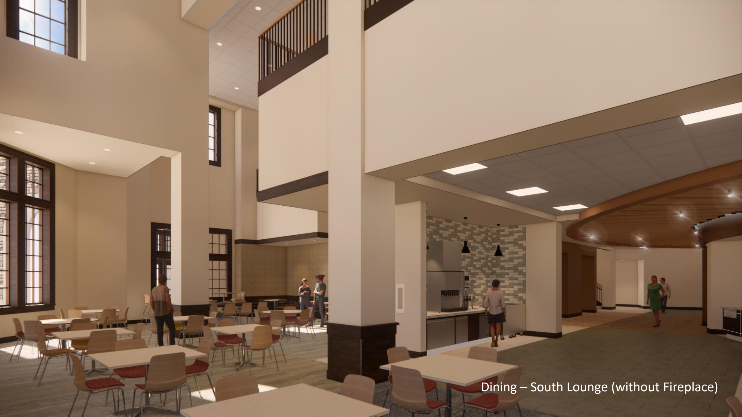
Dining – South Lounge (without Fireplace)