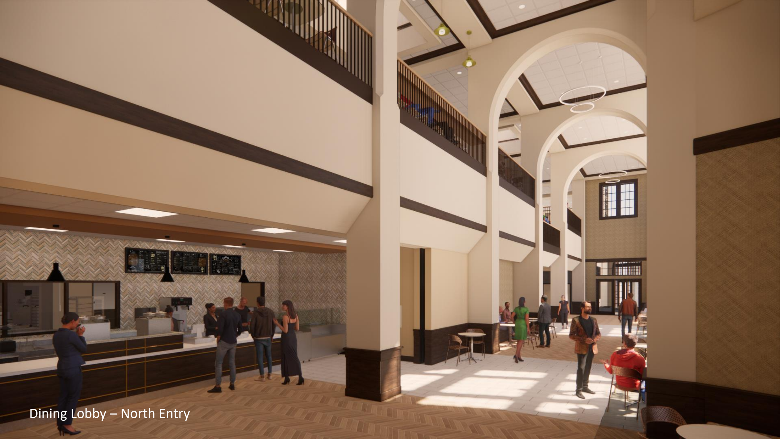
Dining Lobby – North Entry