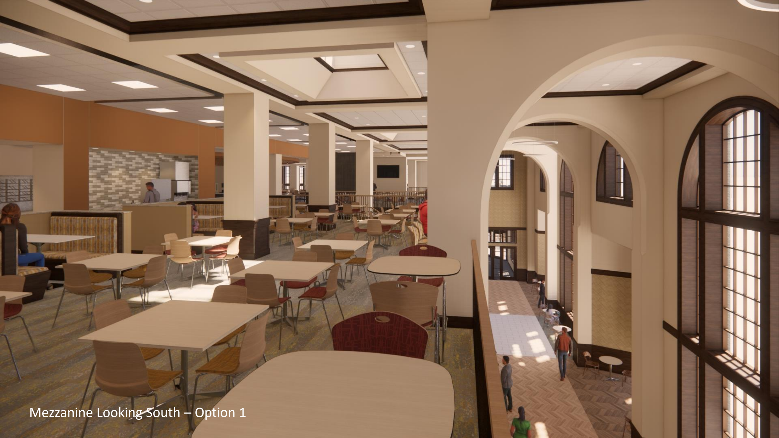
Mezzanine Looking South – Option 1