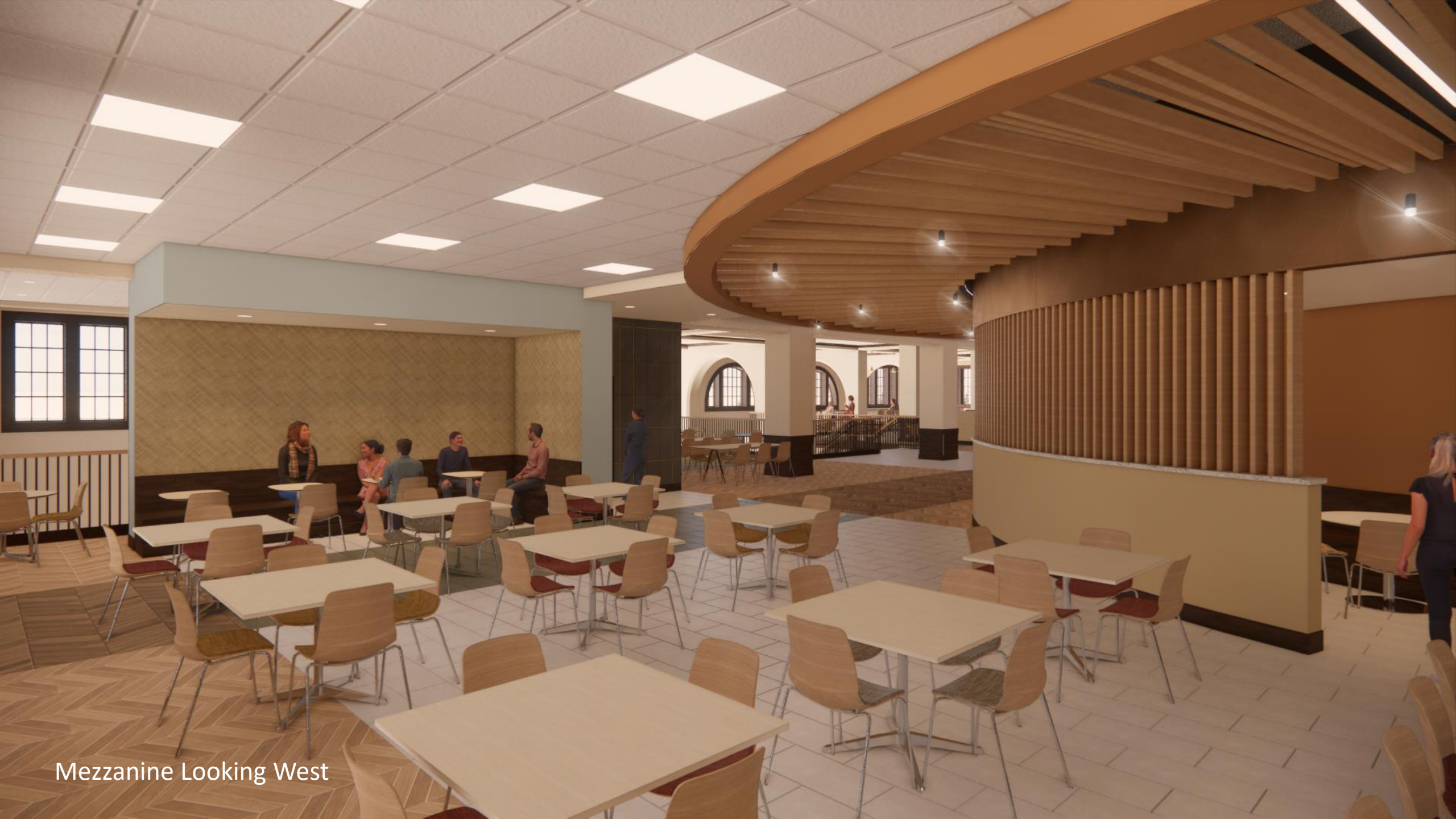
Mezzanine Looking West