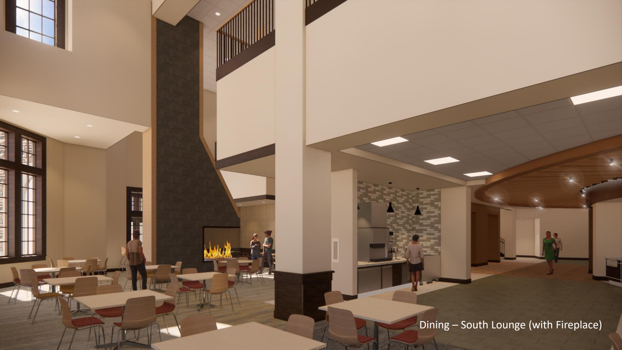
Dining – South Lounge (with Fireplace)