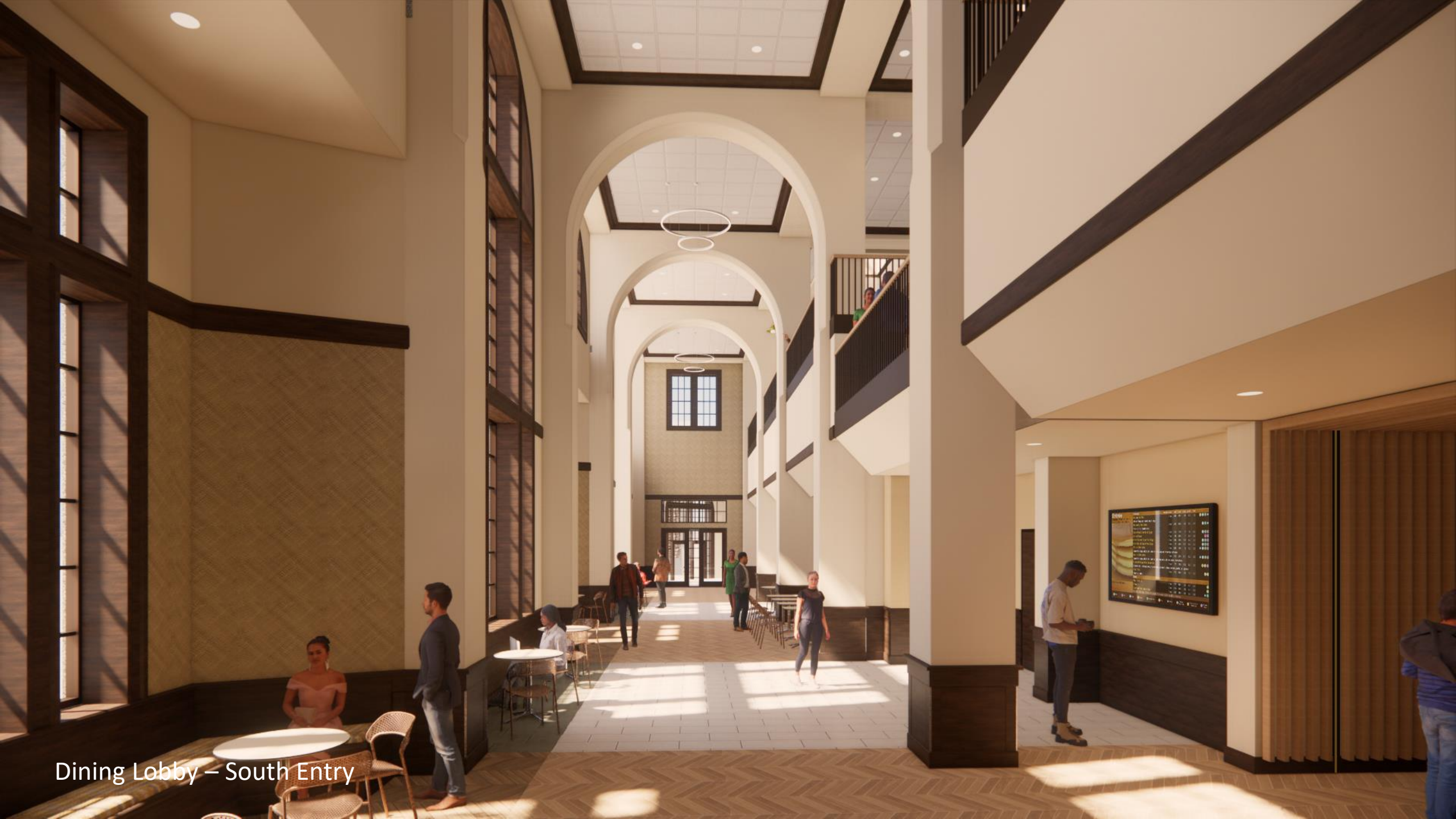
Dining Lobby – South Entry