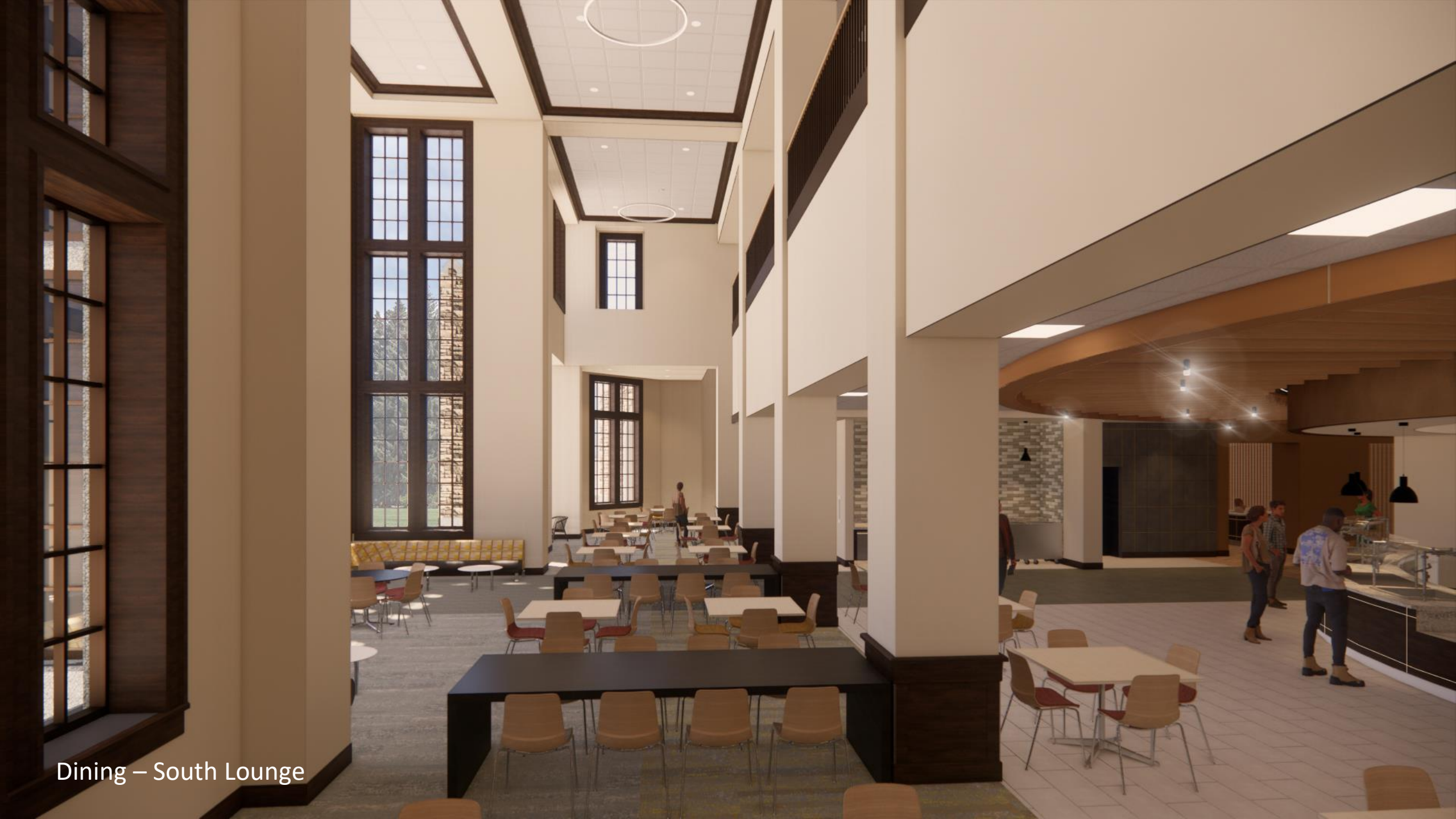
Dining – South Lounge