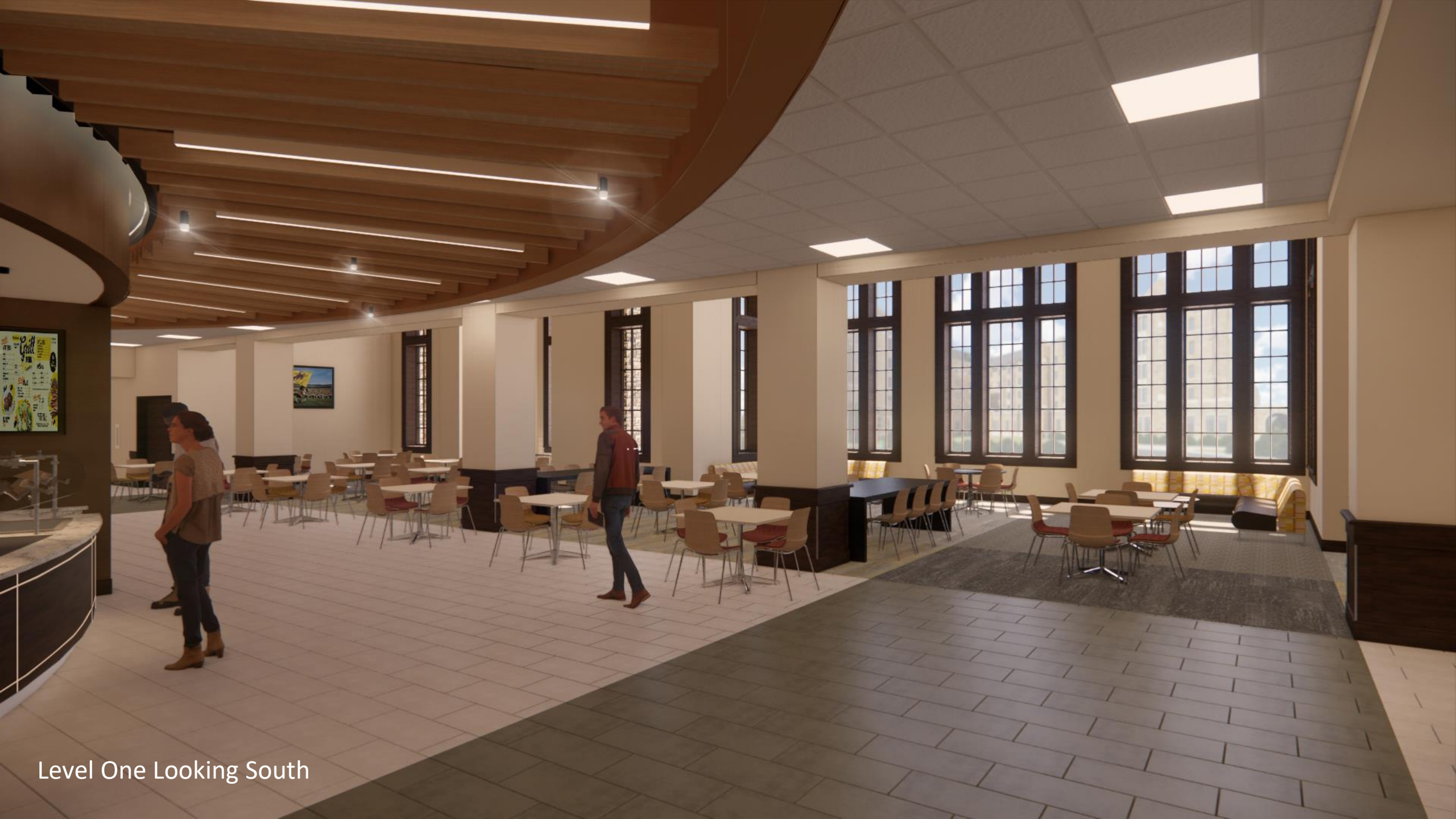
Level One Looking South