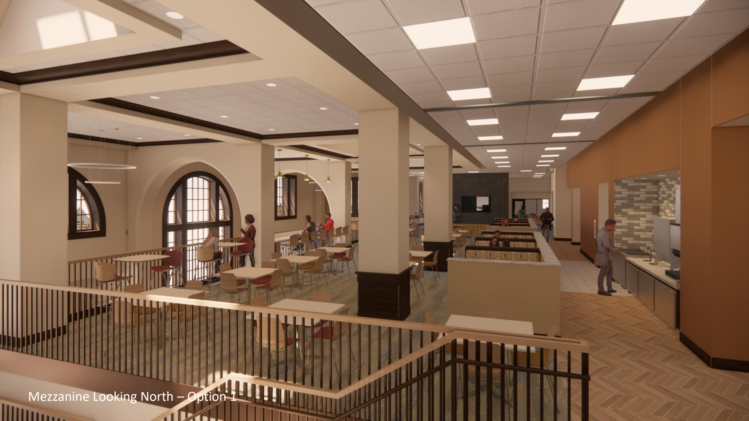
Mezzanine Looking North – Option 1