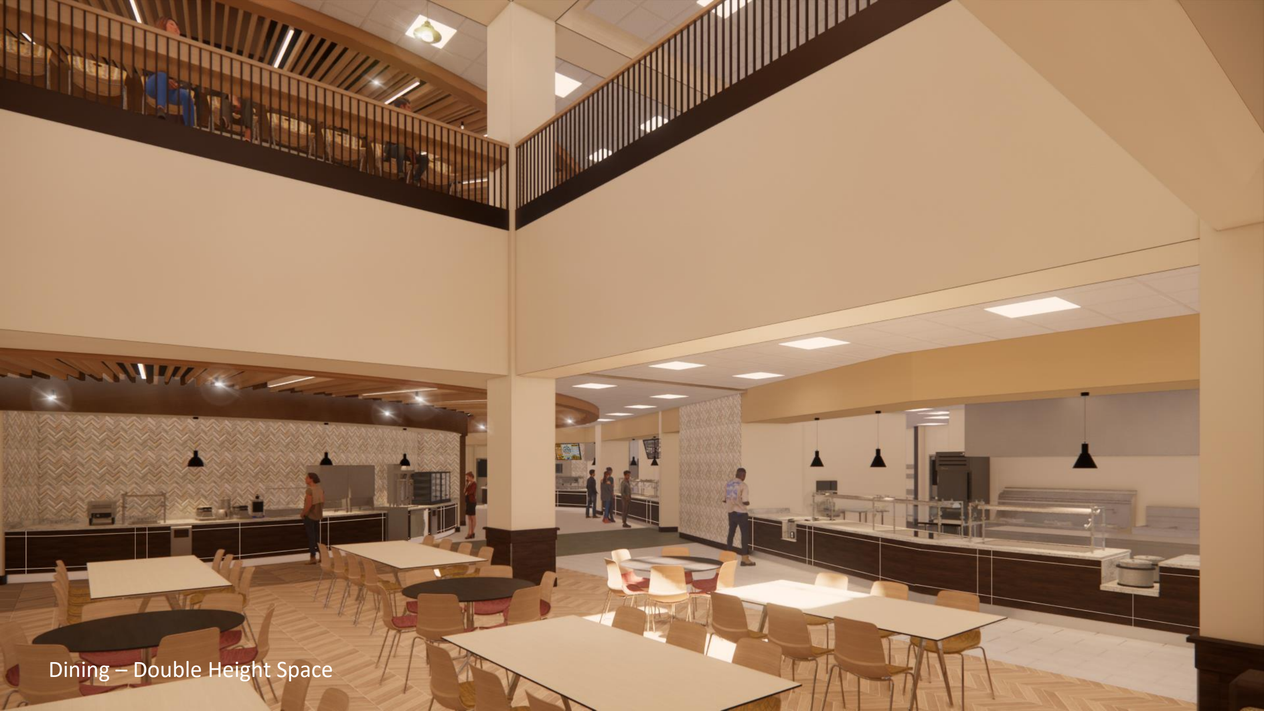
Dining – Double Height Space