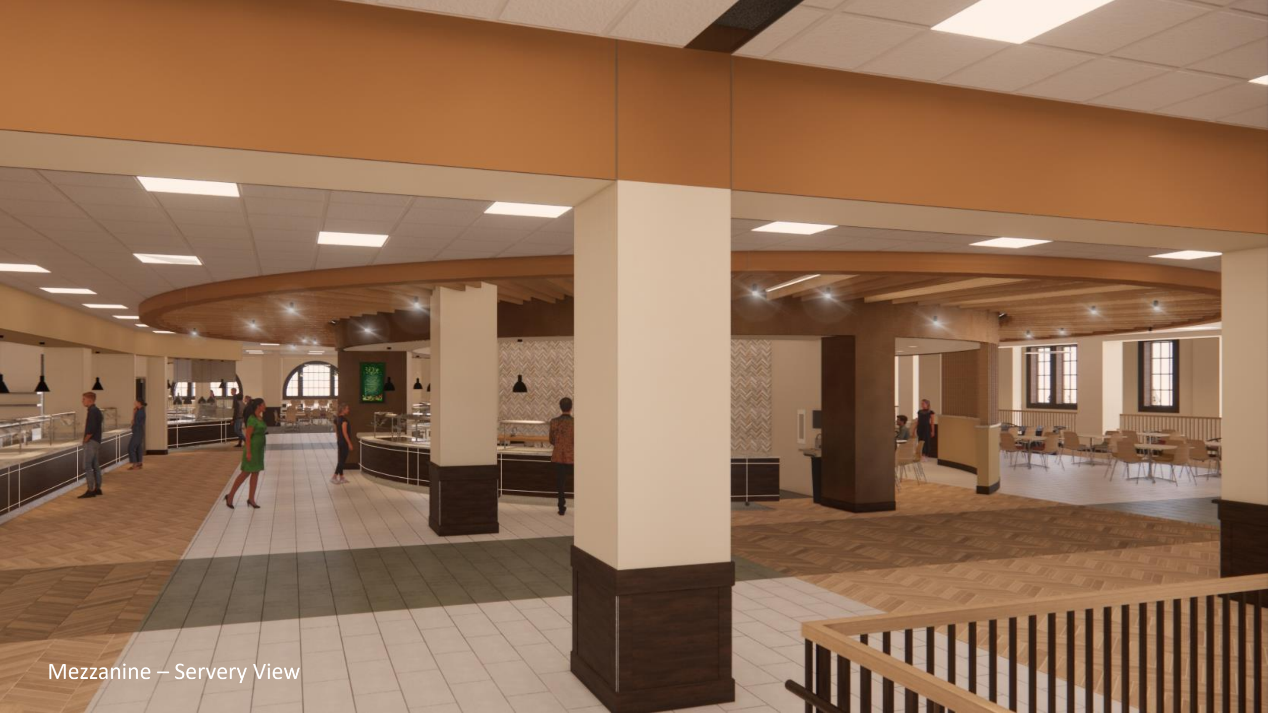
Mezzanine – Servery View