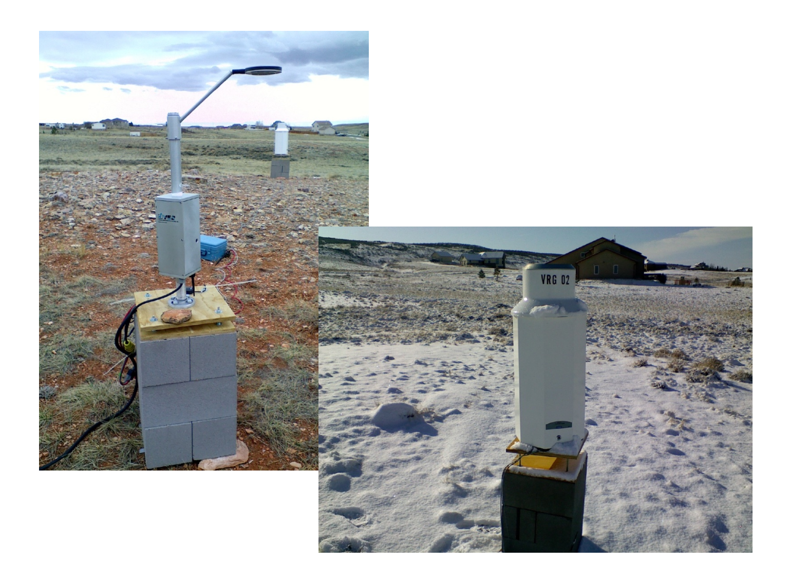
Figure 3 – The UWyo hotplate and a VRG located at the north Laramie site. Measurements were started in early March 2013 and continued into May 2013. See text for details.