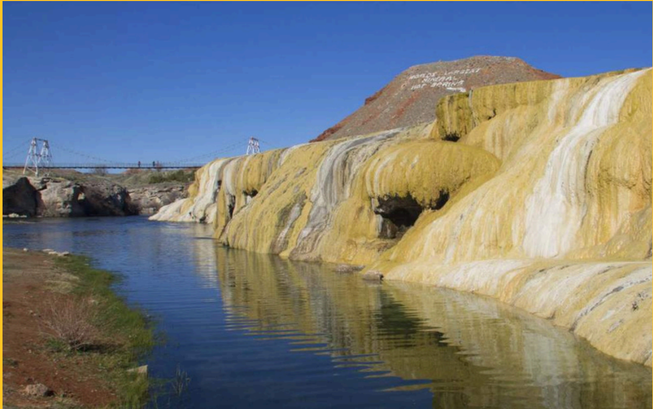
Hot Springs State Park, Thermopolis,WY

UNIVERSITY OF WYOMING SCHOOL OF PHARMACY EXPERIENTIAL EDUCATION