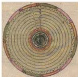
Geocentrism (until 1543)