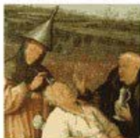
Trephining (14 th century)