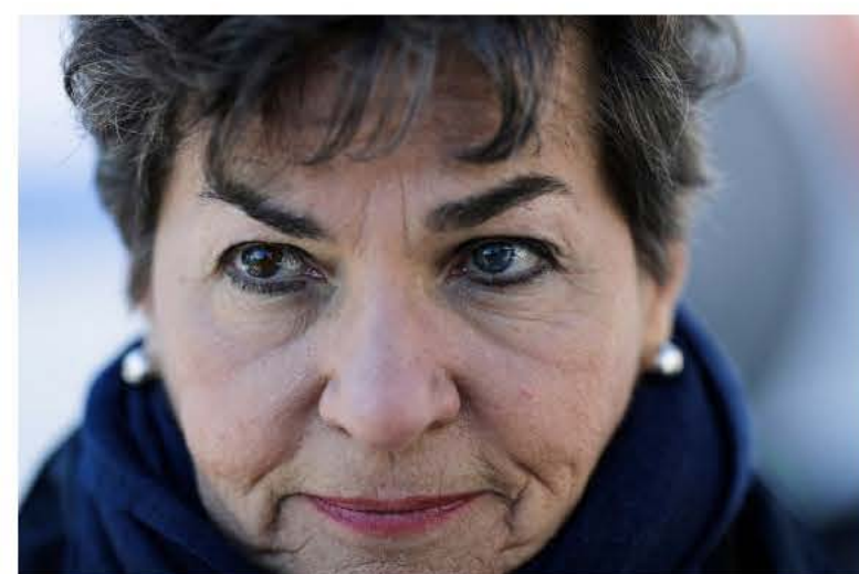
Former UN climate chief Christiana Figueres.

From Chicago, I write about climate change, green technology, energy.