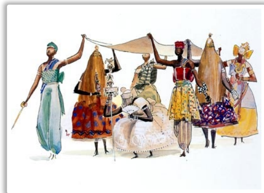
The Candomblé orixas