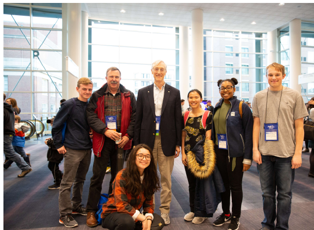
UW undergraduate students with Nobel Laureate John Mather.