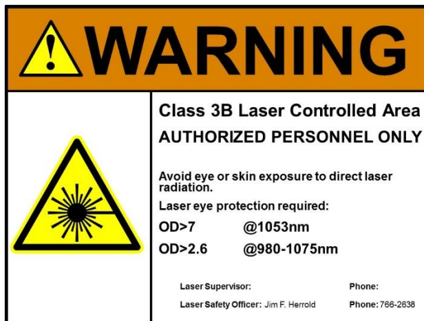
Sample Class 3B WARNING sign