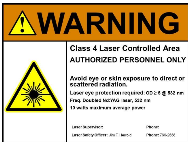
Sample Class 4 WARNING sign (<multi-kW)