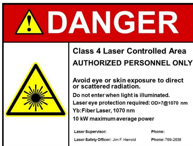
Sample Class 4 DANGER sign (multi-kW)