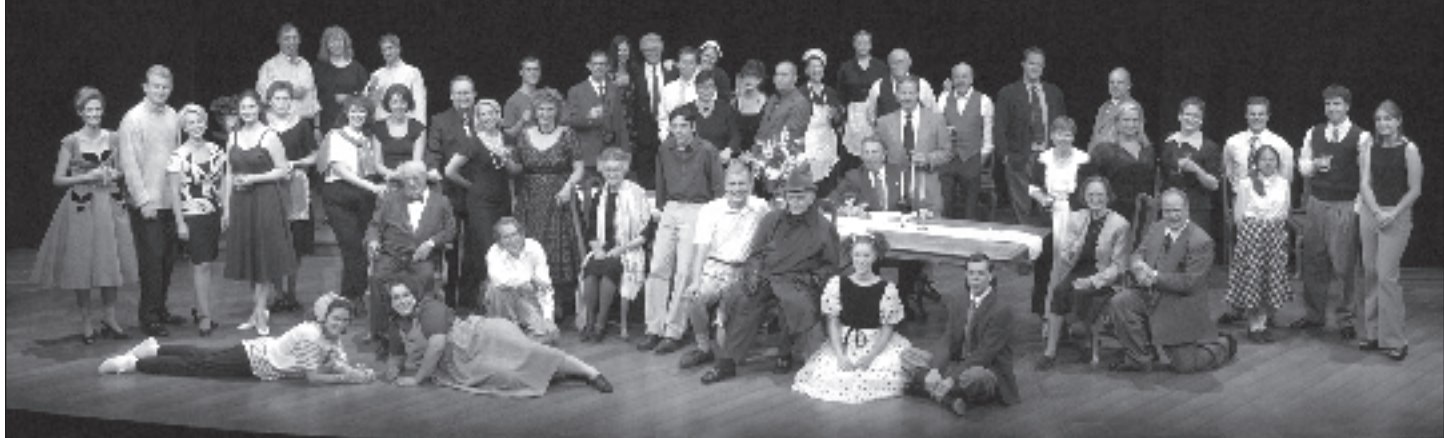
50 YEARS OF SUMMER THEATRE - Over 70 alumni, faculty, staff, and students participated in the production of "The Dining Room."

This is an exciting time for the department as we continue to grow both in numbers and in quality. We invite you to stop by and just visit or take in a show if you have the chance — we are always happy to see you!