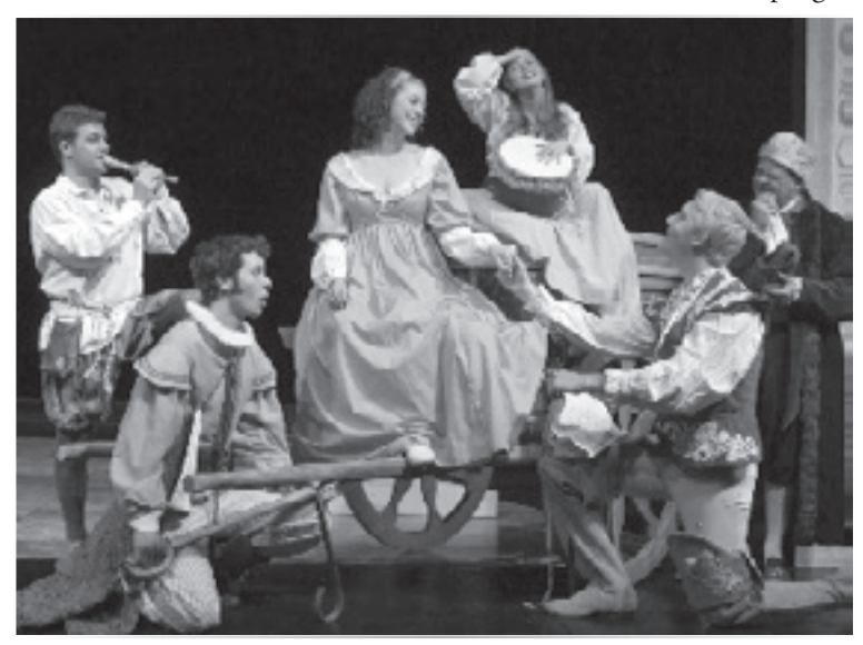
Actors in a summer 2003 production of the popular children's fable "Androcles and the Lion."

But as our program has grown and become nationally recognized for excellence, our funding resources have not kept pace. Due to ever-rising costs and a budget that has not changed in