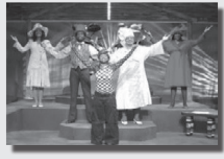
Unicorn Theatre's production of CROWNS.

appeared in CROWNS at the Unicorn Theatre and Gem Theater this spring and in INTIMATE APPAREL at the Unicorn Theatre in June. He also can be seen in the independent film SUS-PENSION (for details, go online to <a href="https://www.suspension-movie.com">www.suspension-movie.com</a>) and in an ad on the Sprint website at <a href="http://pictures.sprintpcs.com/publiclogin.do">http://pictures.sprintpcs.com/publiclogin.do</a>