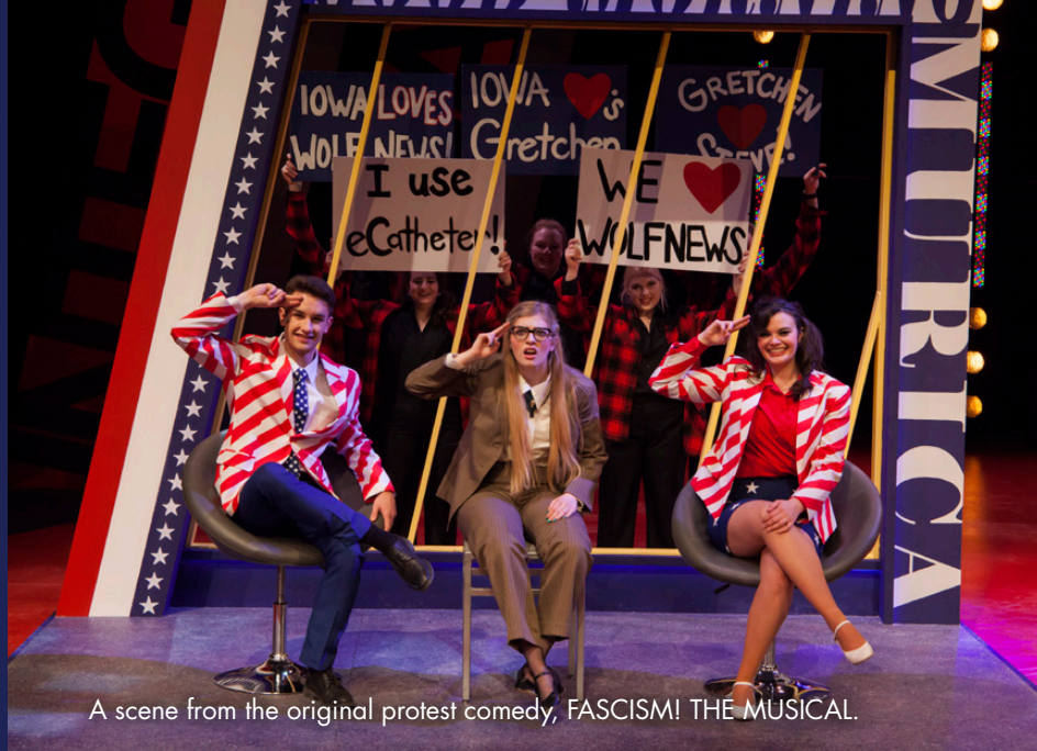
A scene from the original protest comedy, FASCISM! THE MUSICAL.

(307) 766-5100 jchapman@uwyo.edu uwyo.edu/THD