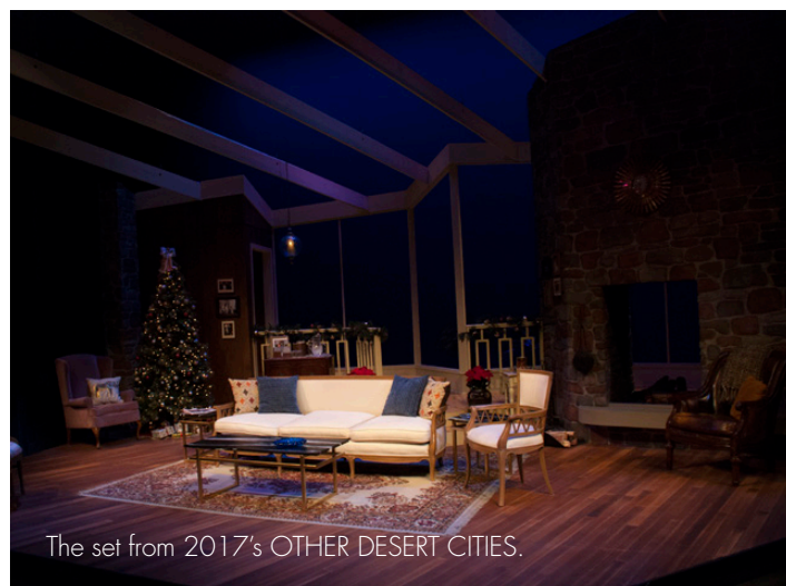
The set from 2017's OTHER DESERT CITIES.

He was previously an adjunct faculty member at The City College of New York and Lehman College. He has been a guest designer at the Juilliard School, NYU/Tisch New Studio on Broadway, The College at Brockport SUNY and the University of Rochester.