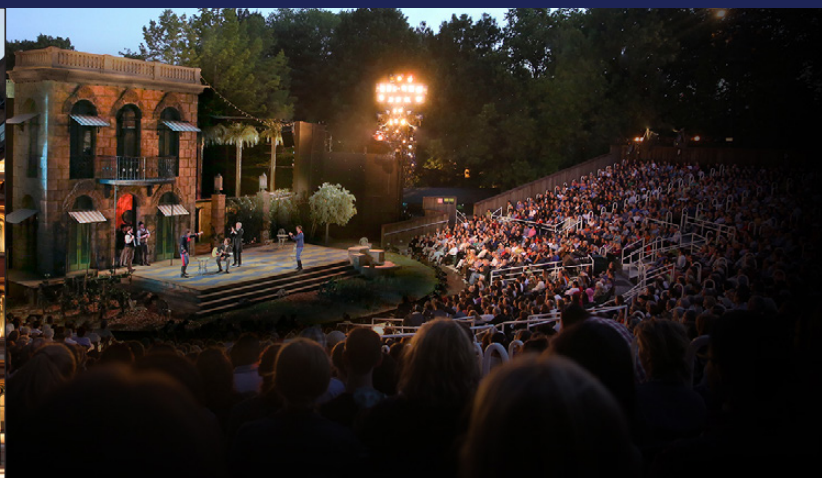
The Public's beloved, free summer program, Shakespeare in the Park, which it operates at the Delacorte Theater in Central Park.