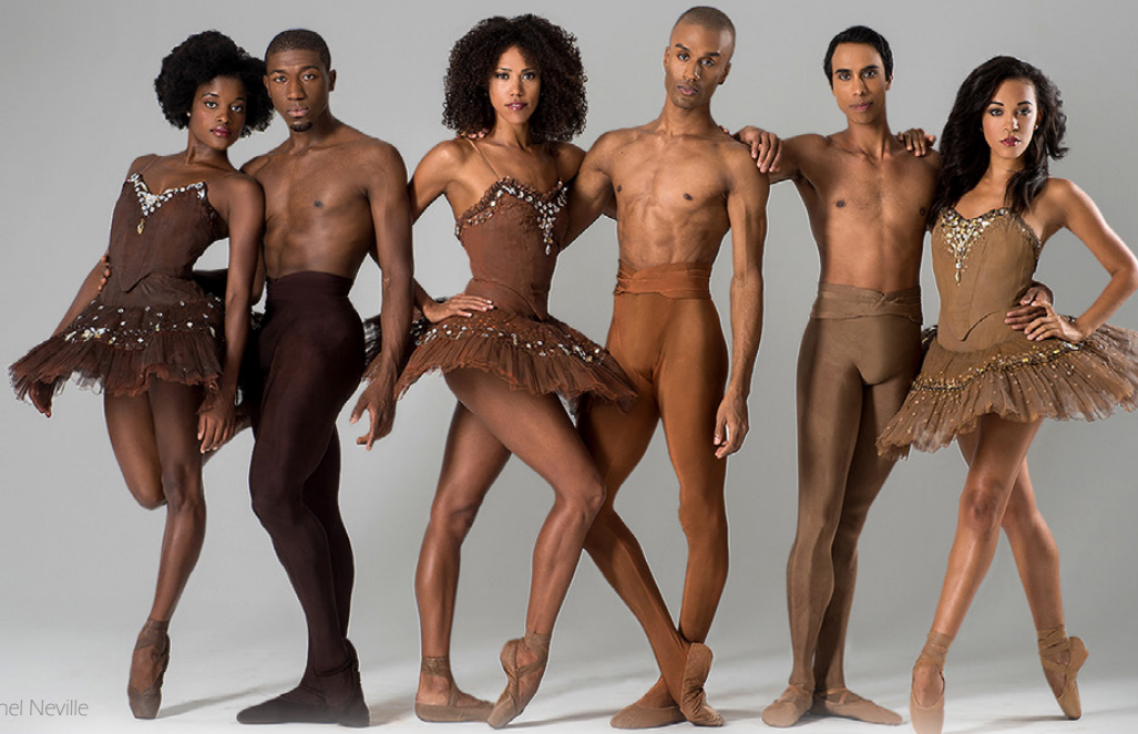
The Company