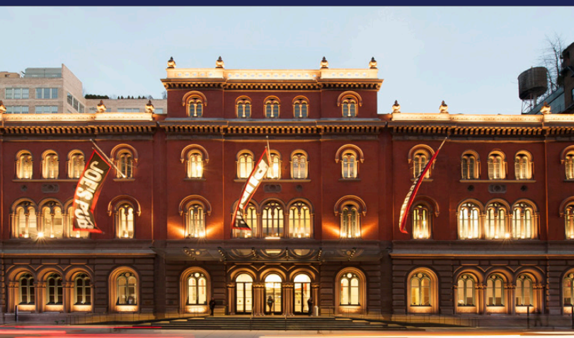
The Public Theater, in the historic Astor Library Building, a NYC landmark. The building has five theater spaces and Joe's Pub, a cabaret-style venue.