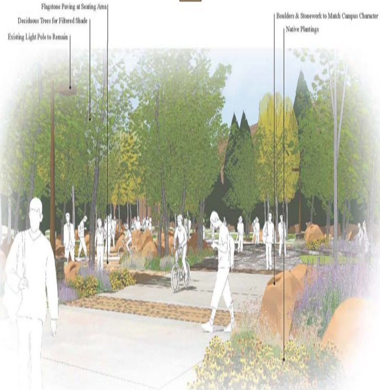
SCHEMATIC PERSPECTIVE NORTH EAST QUAD

Construction Start: Anticipated summer 2012