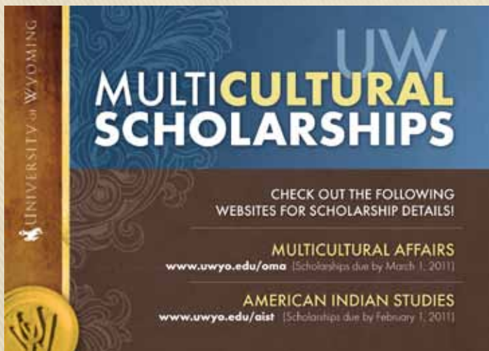
Ethnic Minority Outreach Postcard