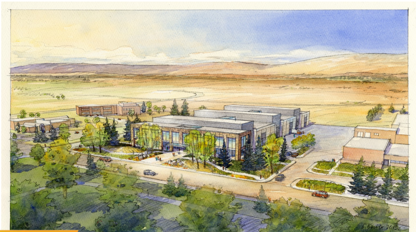
Stephanie Bower, Architectural Illustration

Special Note: LEED Silver equivalency anticipated