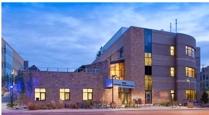
The Bob and Carol Berry Conservation Center building, home to several biodiversity-related activities, including the Biodiversity Institute

The purpose of the Berry Center is not brought in question by the circumstances that surround the BI; in fact, the opportunity to strength this facility's role in biodiversity activities exists, enabled in part by its close proximity to the Science Initiative facility. At present, the Berry Center is host to much biodiversity-related work, including: UW's Stable Isotope Facility, a center for world-leading research that engages UW students, postdocs, and faculty; administrative support and students participating in