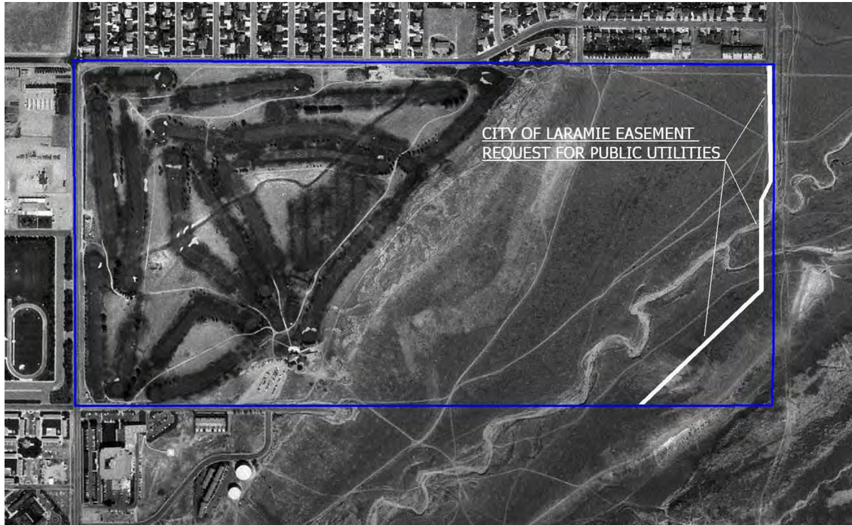
CITY OF LARAMIE EASEMENT REQUEST FOR PUBLIC UTILITIES (DATED 10/29/02)