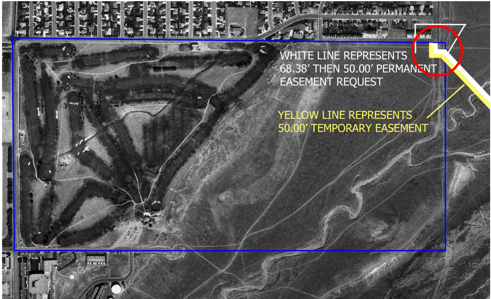
CITY OF LARAMIE EASEMENT REQUEST RESUBMITTAL (DATED 2/17/02)