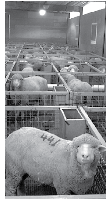
Sheep confinement facilities at the UW livestock farm.

On the Web: http://uwadmnweb.uwyo.edu/FE-TALPROGRAMMING/ 🐑