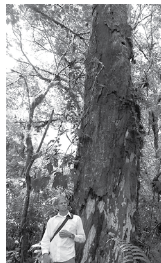
Andrew Townsend searches for a suitable caterpillar plot location.

Not so the gregarious wasps. “They attack either the really hairy or spiny caterpillars, good defenses against birds but inside they are probably OK to eat. It’s relatively safe for a wasp to put large numbers of eggs in large, hairy, or spiny caterpillars,” notes Shaw. 🐛