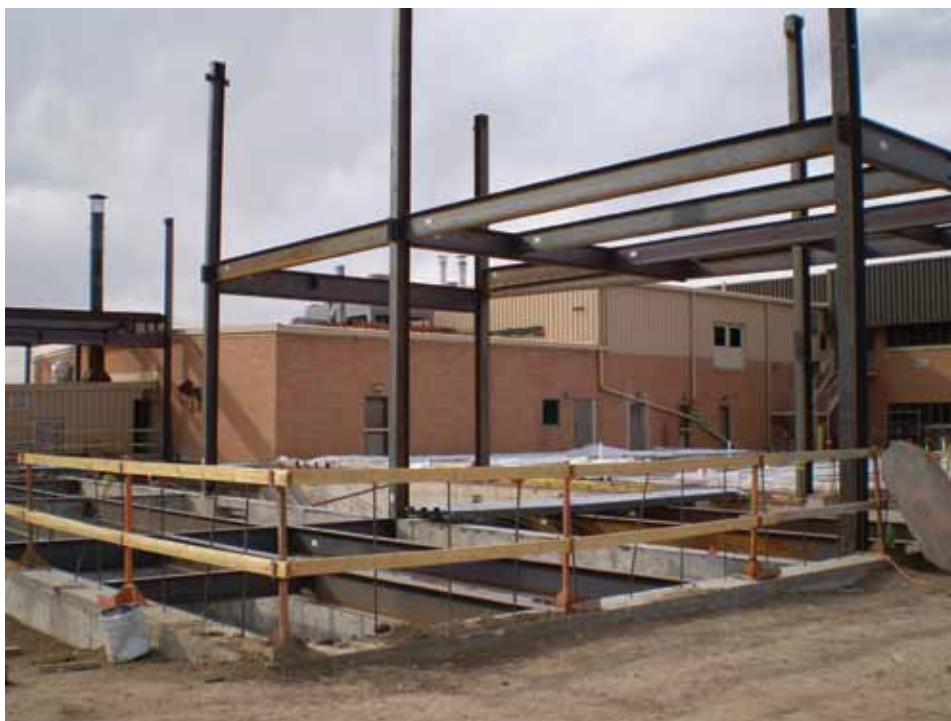
Construction is well underway on the new biosafety level 3 lab at the Wyoming State Veterinary Laboratory.

Construction is expected to be complete by fall. The construction manager at risk is GH Phipps Construction Companies, which has offices in Colorado and Cheyenne.