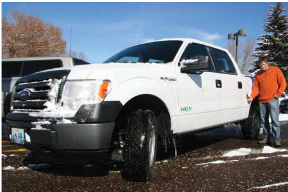
UW Extension energy coordinator Milt Geiger shows the compressed natural gas filler valve.

“Natural gas is a plentiful fuel with great potential to reduce the nation’s reliance on imported oil,” says Whipple. “It makes sense that Wyoming, a state where natural gas production is a critical economic contributor, would be a leader in the use of CNG as a motor fuel.”