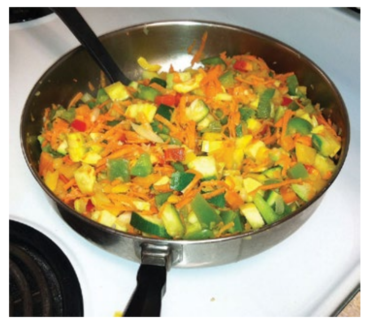
The Real Food Program encourages a variety of recipes that include fresh fruit, whole grains, local meat and eggs, and fresh vegetables.

"We pay attention to labels and ingredients. We have stopped drinking pop. We are more aware of what we are eating, and my husband has lost weight."