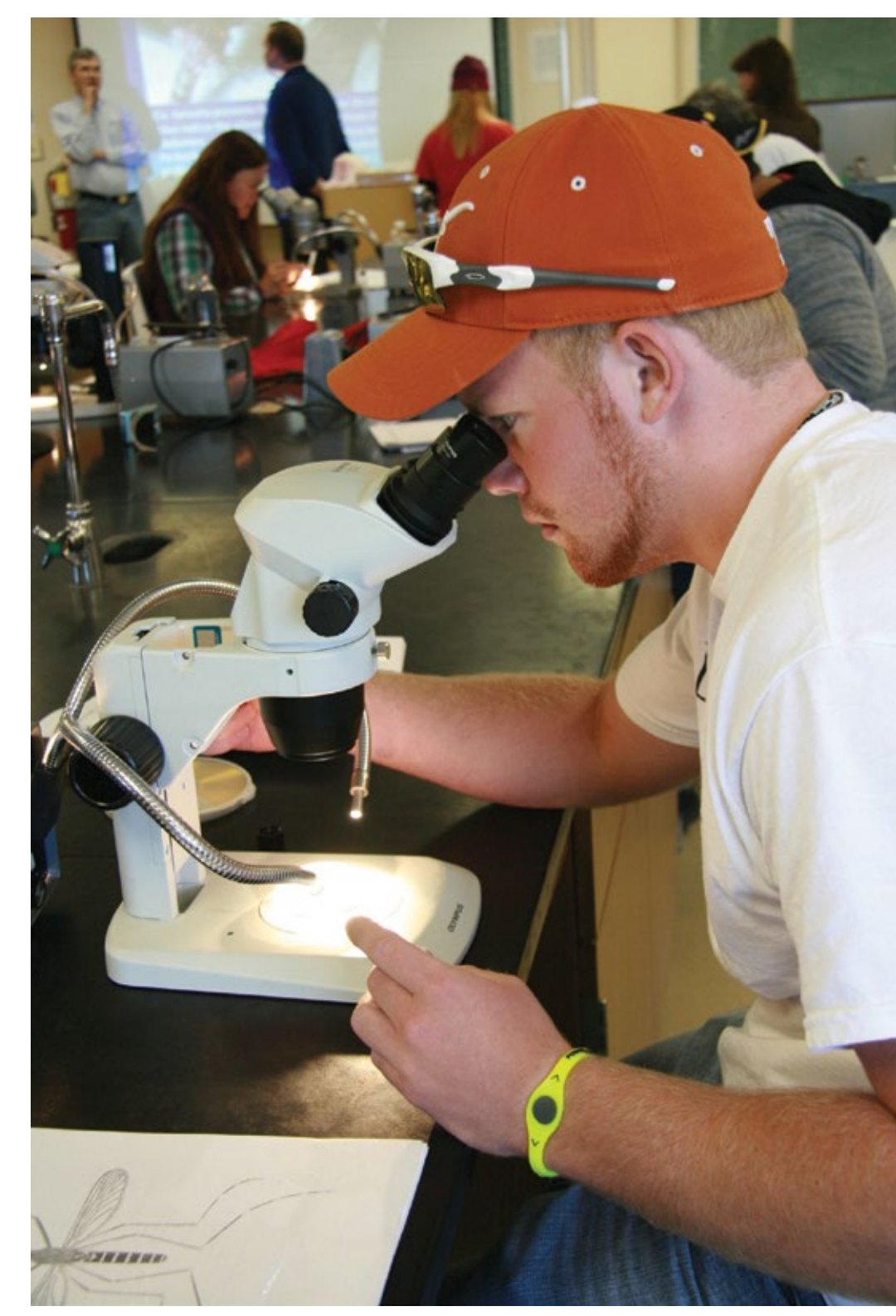
Mosquito control personnel from towns and weed and pest control districts learn to identify the West Nile virus carrier Culex tarsalis mosquito.

Participants learned where they can get more detailed information on mosquito pests and advanced mosquito management techniques that will aid them