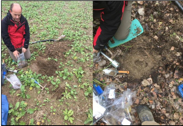
Prof Kabala collects samples in field of winter canola and beneath forest litter.

In October, 2016, we collected soil samples from three replicated points at three depths (0-5, 5-20, and 20-30 cm) on each side of the land use boundary at three locations (Close, moderate, and far from the smelter; see Fig 2.).