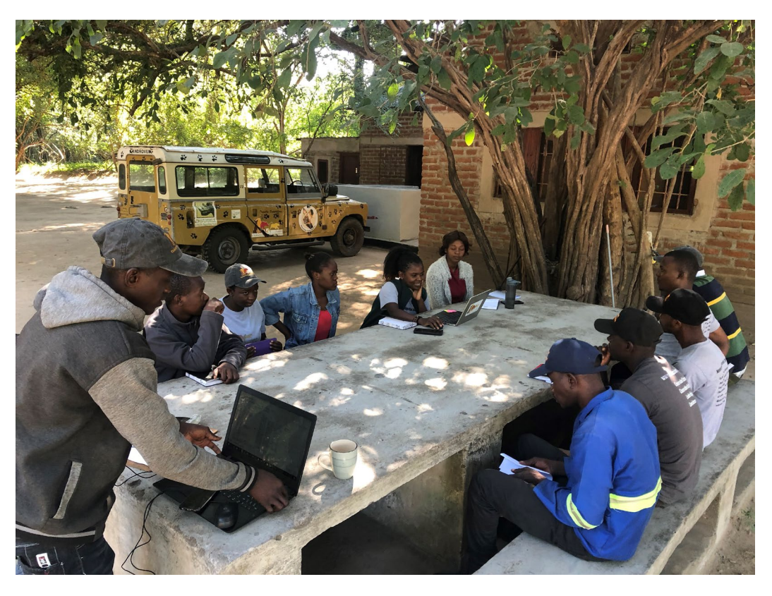
Team meeting to discuss current monitoring protocols for wildlife and human/livestock conflicts at Zambian Carnivore Programme headquarters, Mfuwe, Zambia (14 May 2022).