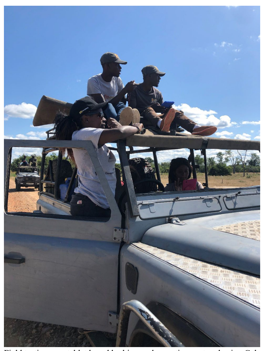
Field testing new tablet based herbivore observation protocol using CyberTracker database with the Zambian Carnivore Programme – Luangwa Team in South Luangwa National Park, Mfuwe, Zambia (17 May 2022)