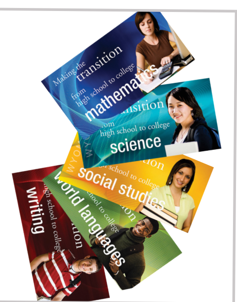
Check out the original trifolds at www.uwyo.edu/ than an hour. Each wsup/publications before the Partnership's spring meetings. team utilizes Google

Insights so far As of January 12, 2017, the Social Studies, World Languages, and Writing revision teams have met three times by ZOOM conference. and the Science and Mathematics team has met twice. The plan is to meet weekly for no more