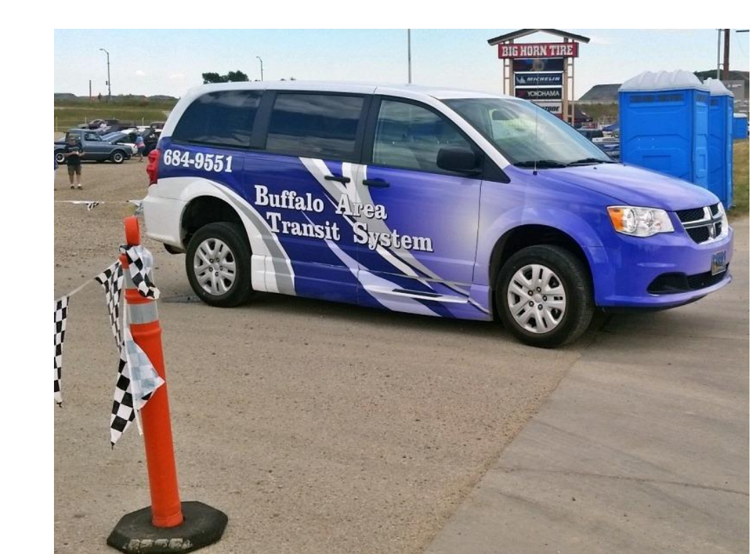
One of the vans BATS uses for their transit service