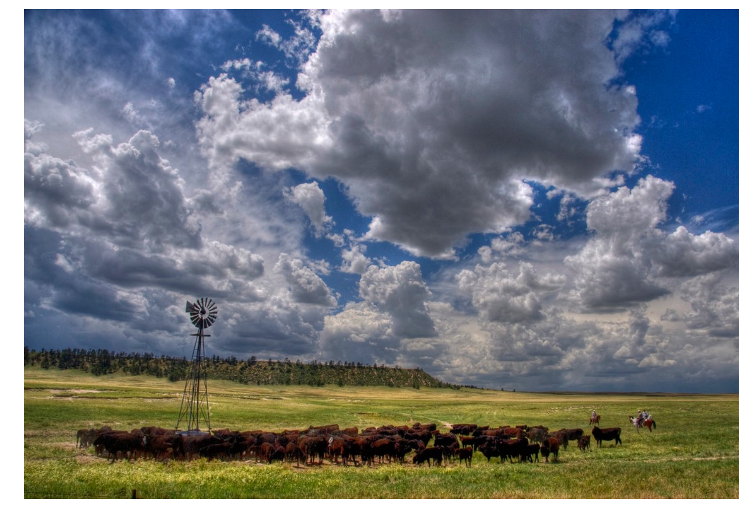
Local ranchers at work outside of Lusk