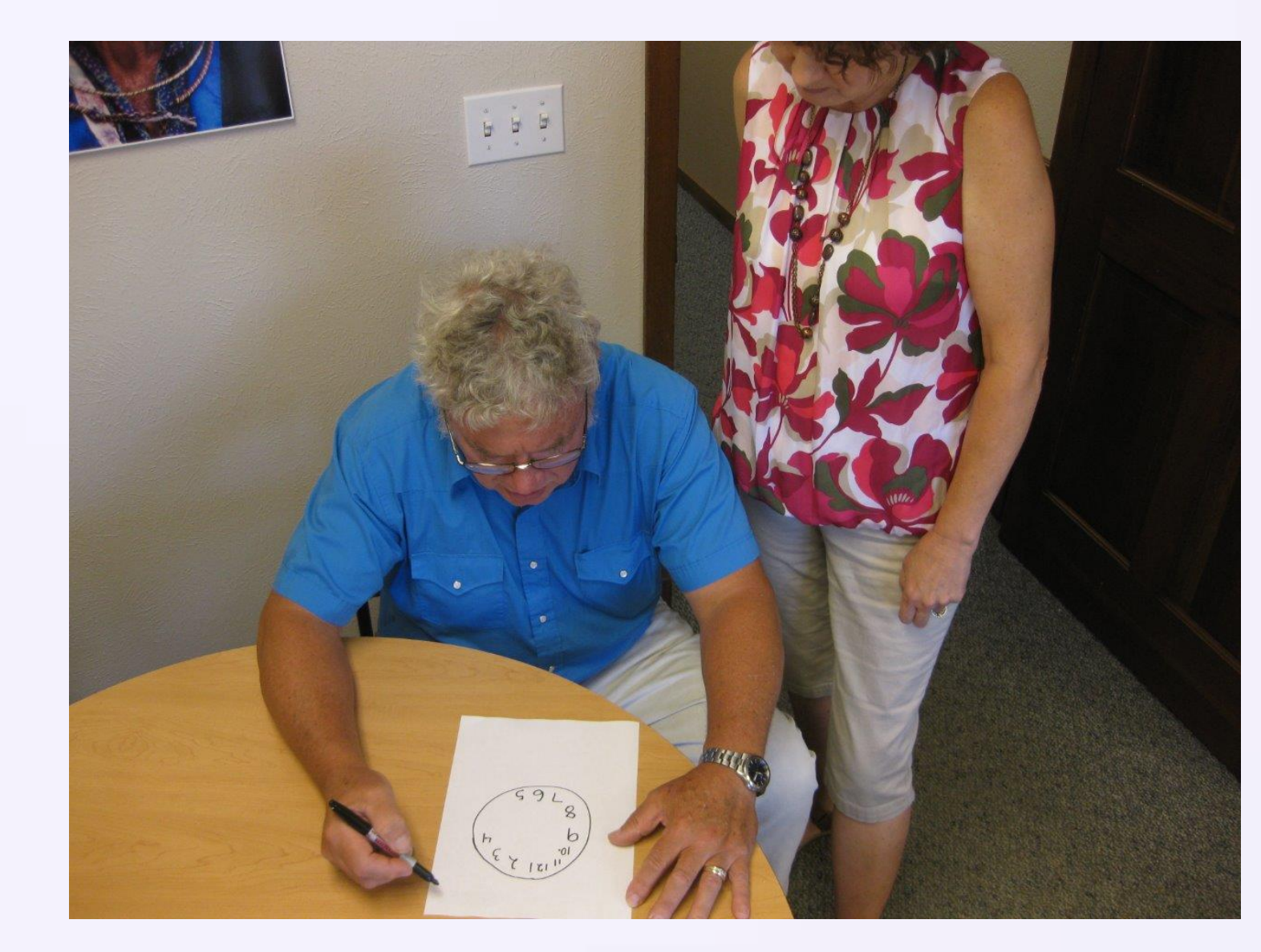
In-Home Services Case Managers practice administering and scoring the Mini-Cog<sup>TM</sup>