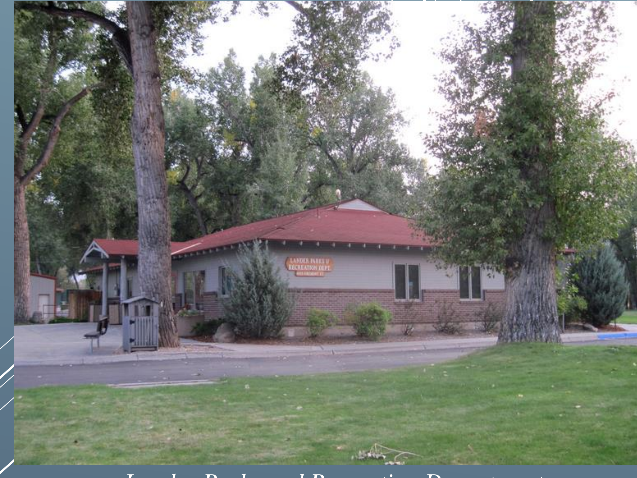
Lander Parks and Recreation Department