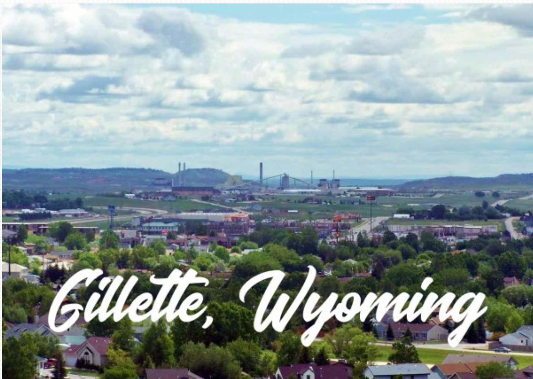
Gillette cityscape with Wyodak Power Plant in background