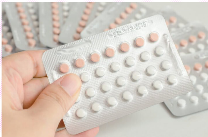
Typical oral contraceptive pack