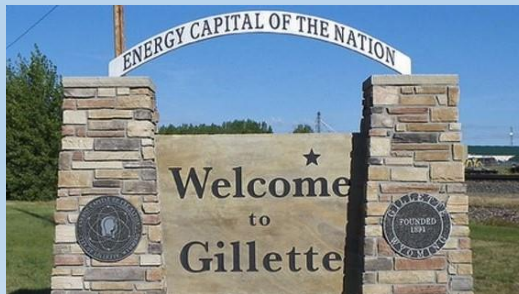
Coal, coalbed methane, and oil provide many local jobs.