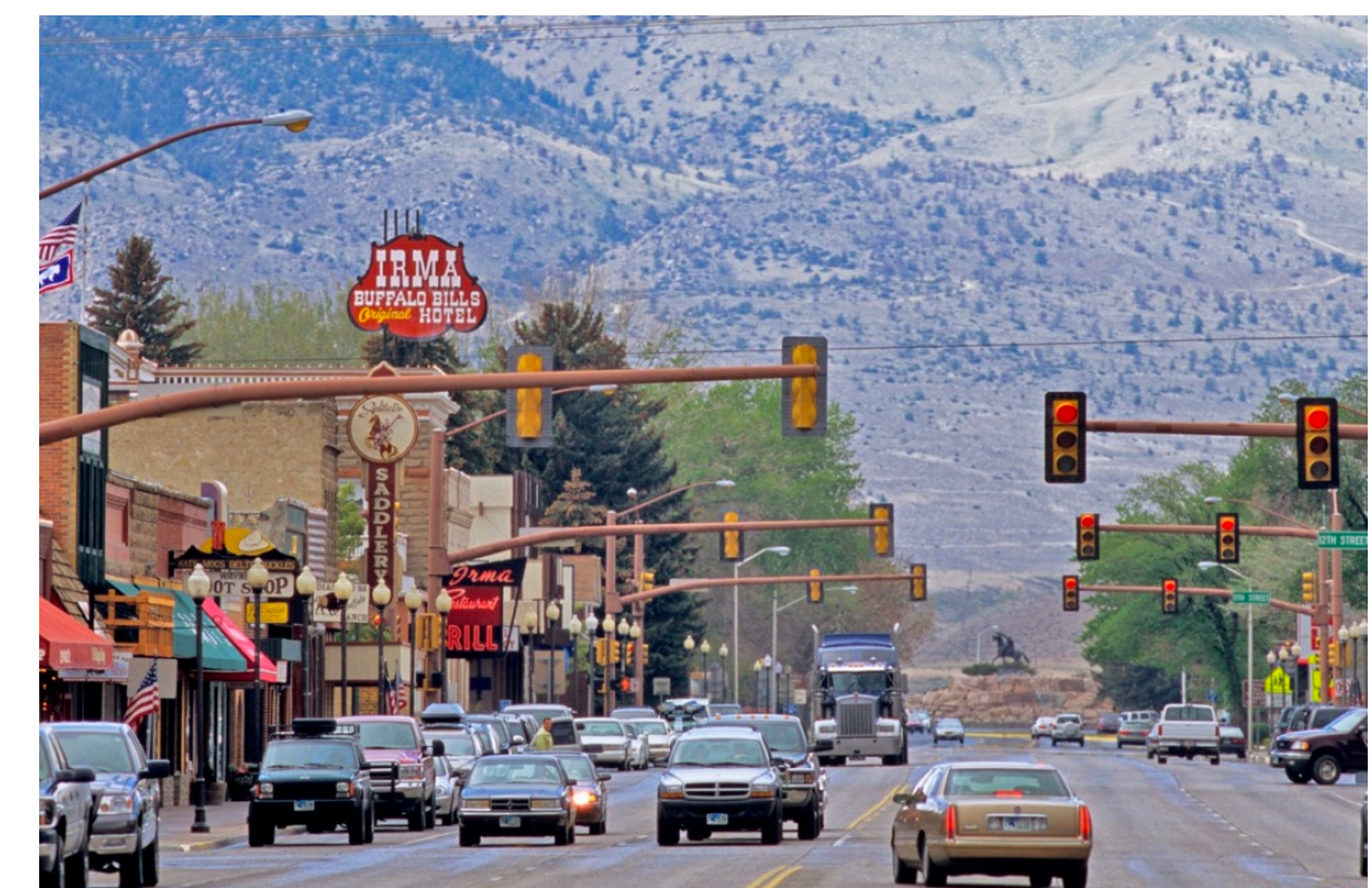
Downtown Cody, Wyoming