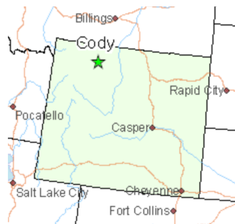
Location of Cody, Wyoming