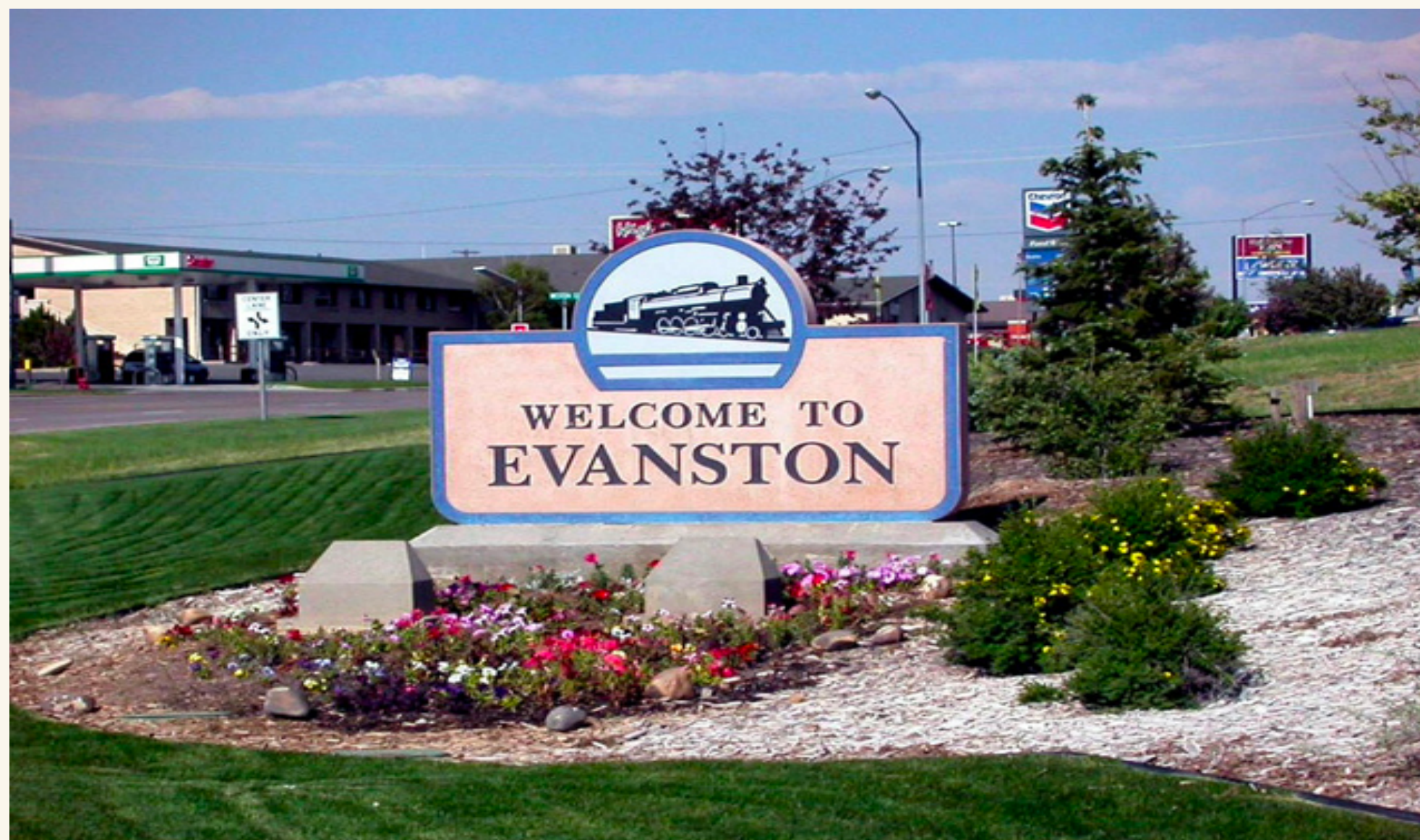
Welcome Sign in Evanston, WY