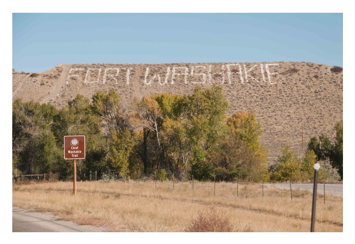
Fort Washakie, Wyoming

Increasing access to naloxone through distribution to bystanders will reduce the burden of opioid related overdose deaths on the the Wind River Indian Reservation