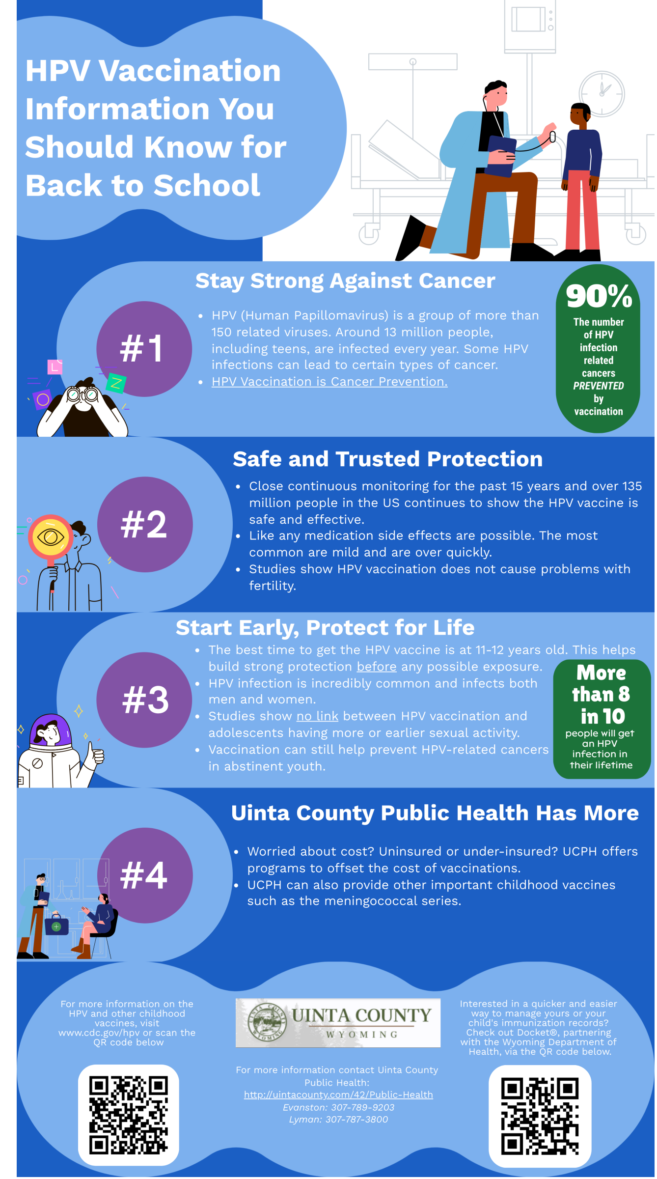
Infographic presented to Uinta County Public Health for distribution

Messaging tailored for Evanston highlighted cancer prevention, safety, life-long protection, and misconceptions regarding sexual activity