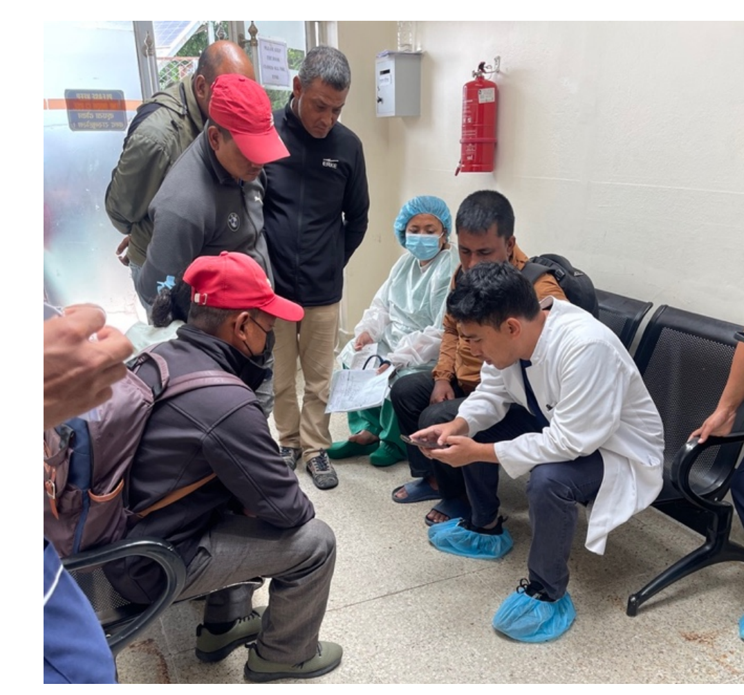
Fig 2. Typical family conference environment

The development of these materials coincided with the opening of a specialized Neurological ward at Dhulikhel Hospital and a new national focus on stroke care and outcomes