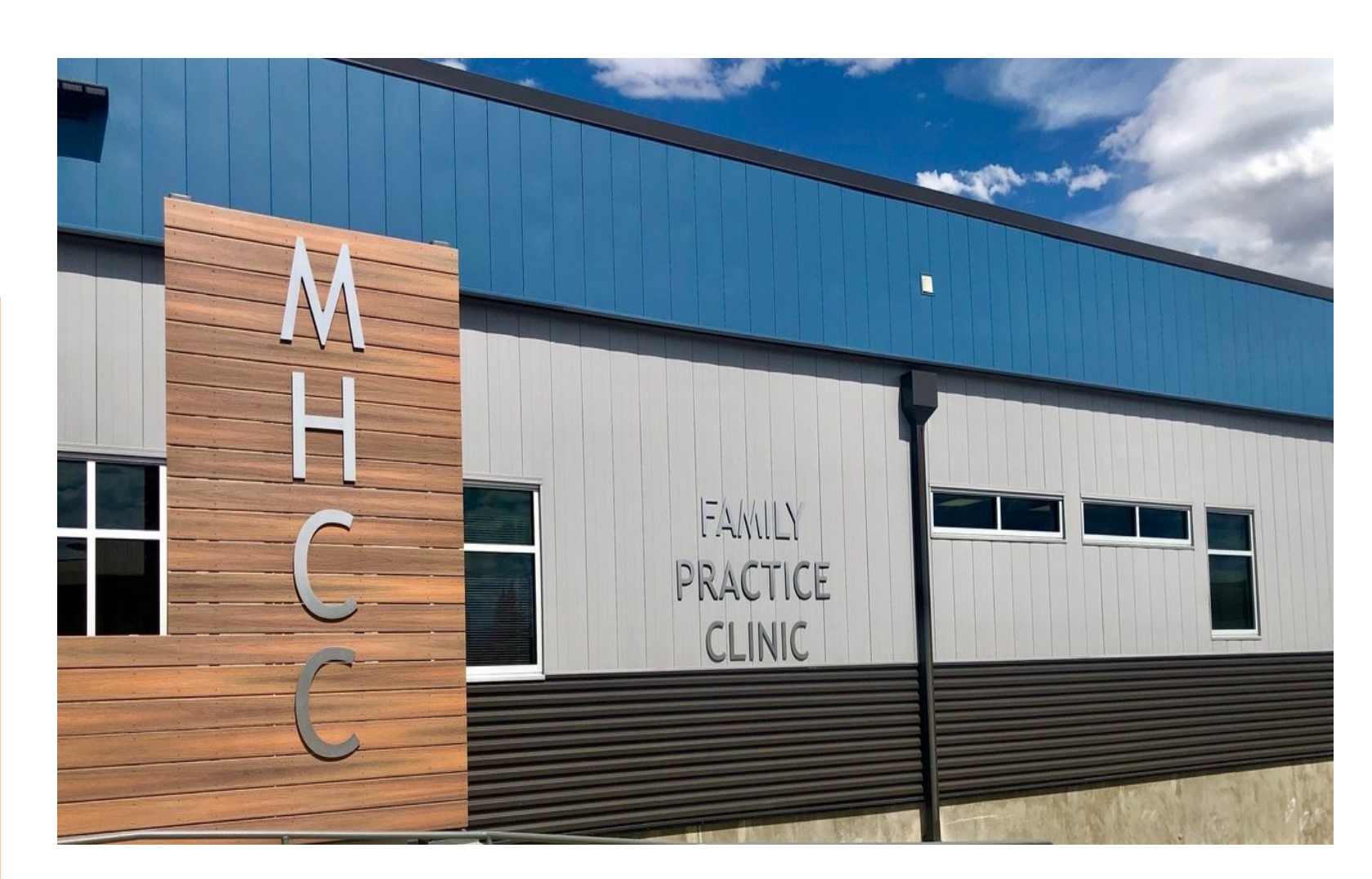
Memorial Hospital of Carbon County Family Practice Clinic in Rawlins, WY