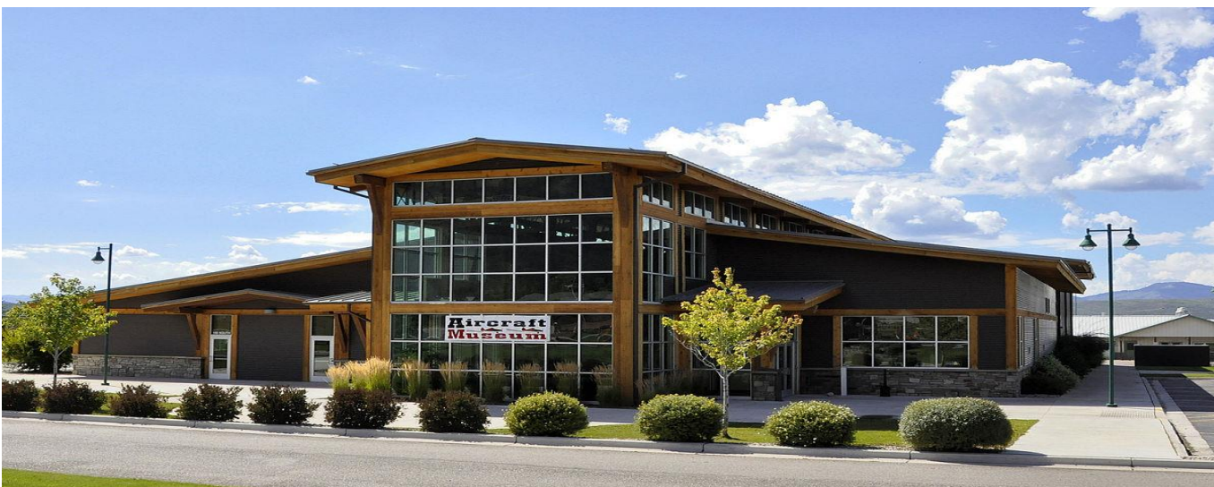
Afton, WY Civic Center and Aircraft Museum