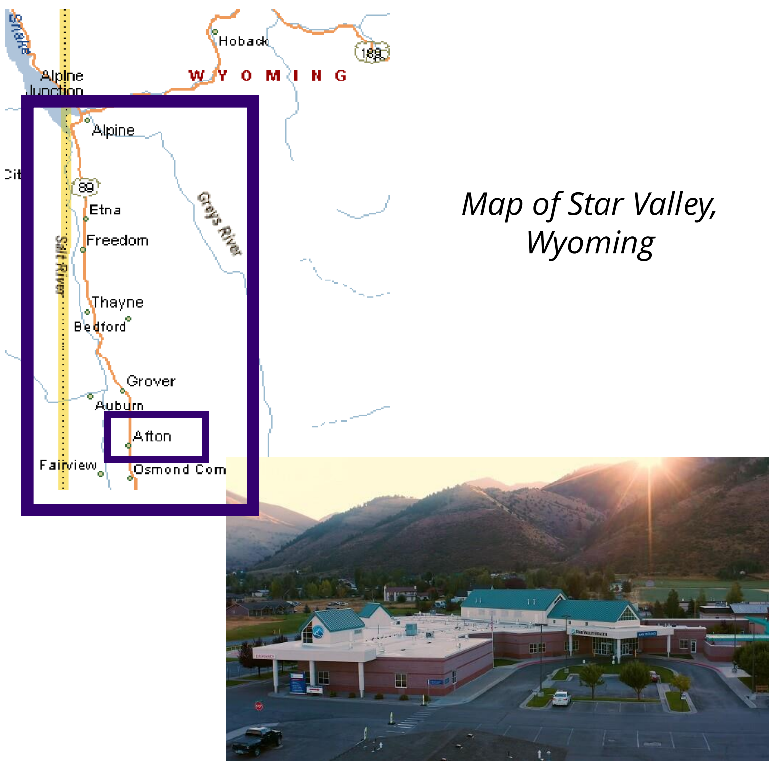
Star Valley Health Hospital in Afton, WY