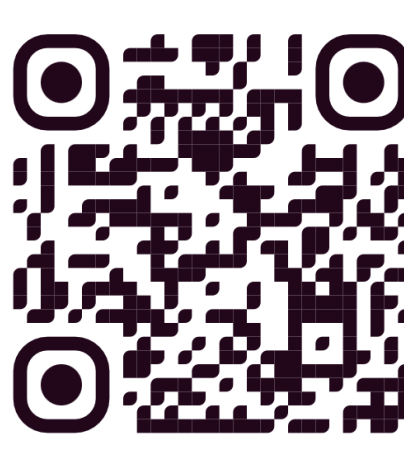
Figure 2: QR Link to Page One of Memorial Hospital's Medical Assistance Program Application. (Please scan with your smartphone camera.)