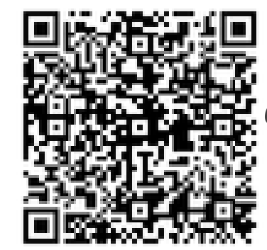
Figure 3: QR Link to complete How To Guide (Please scan with your smartphone camera.

III. <u>Resources</u> that are available in Sweetwater County to help you as you apply