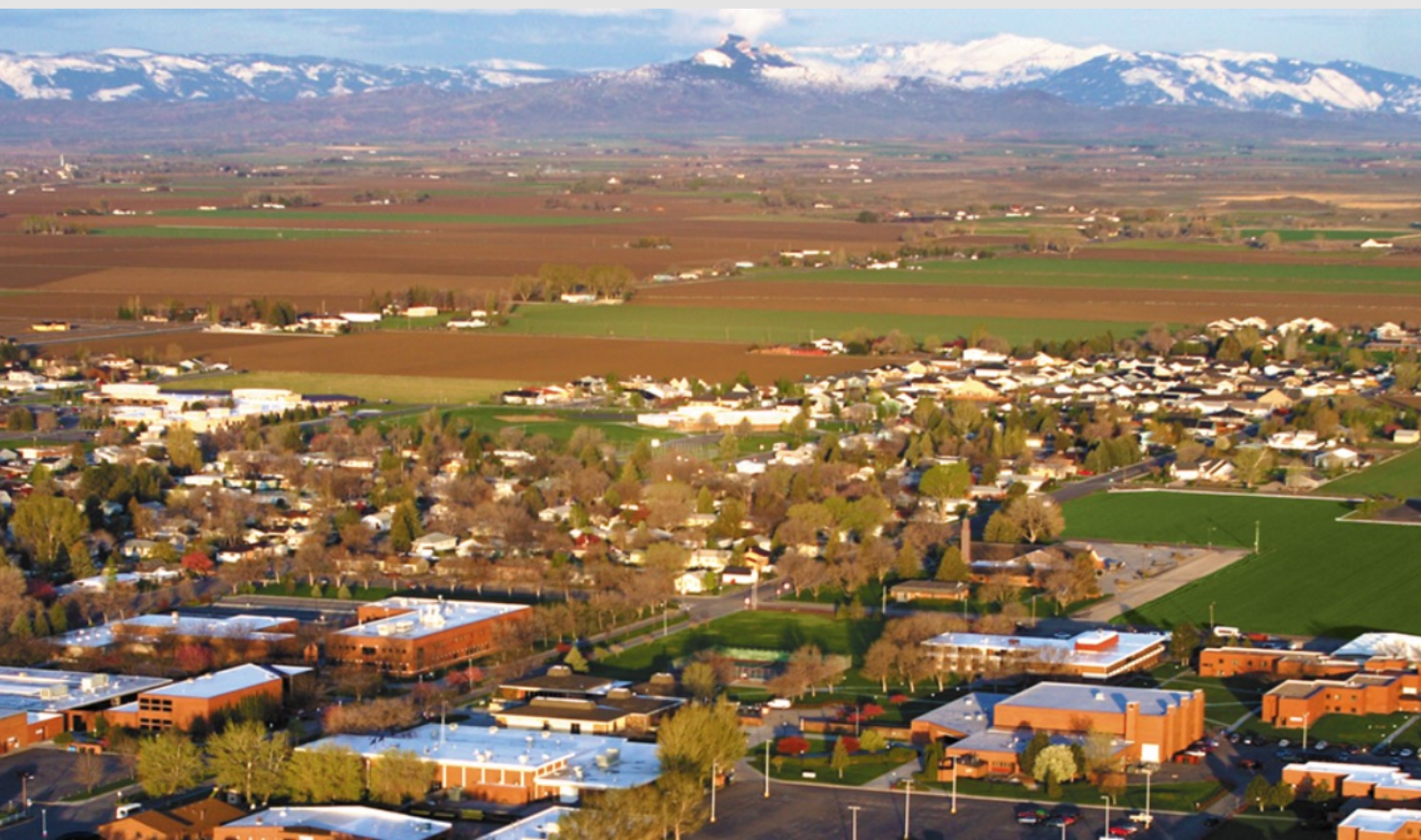
Powell Wyoming with Heart Mountain in background