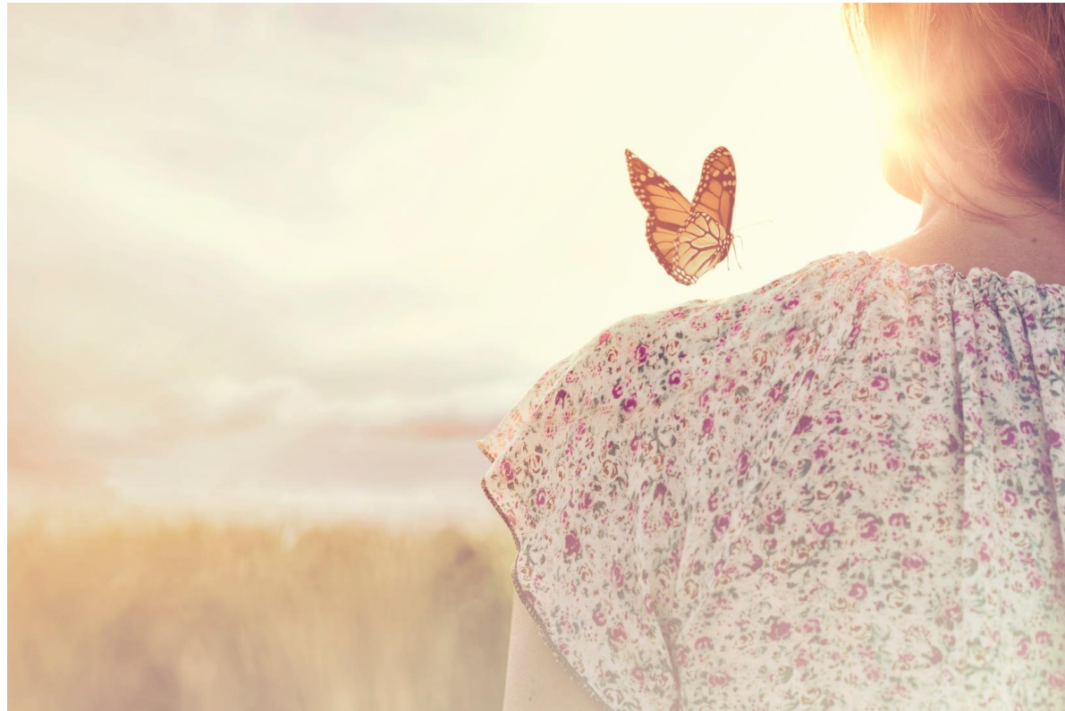
Stay in the moment