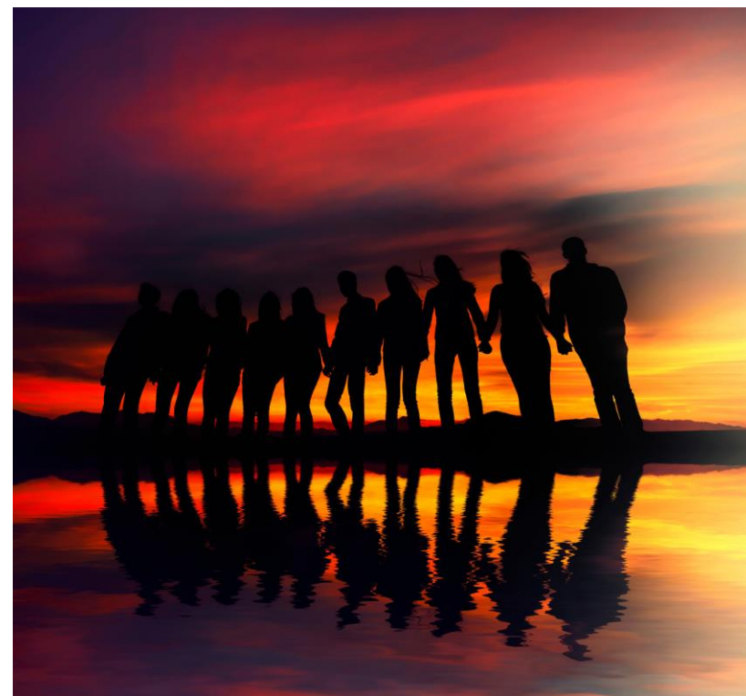
We are in this together