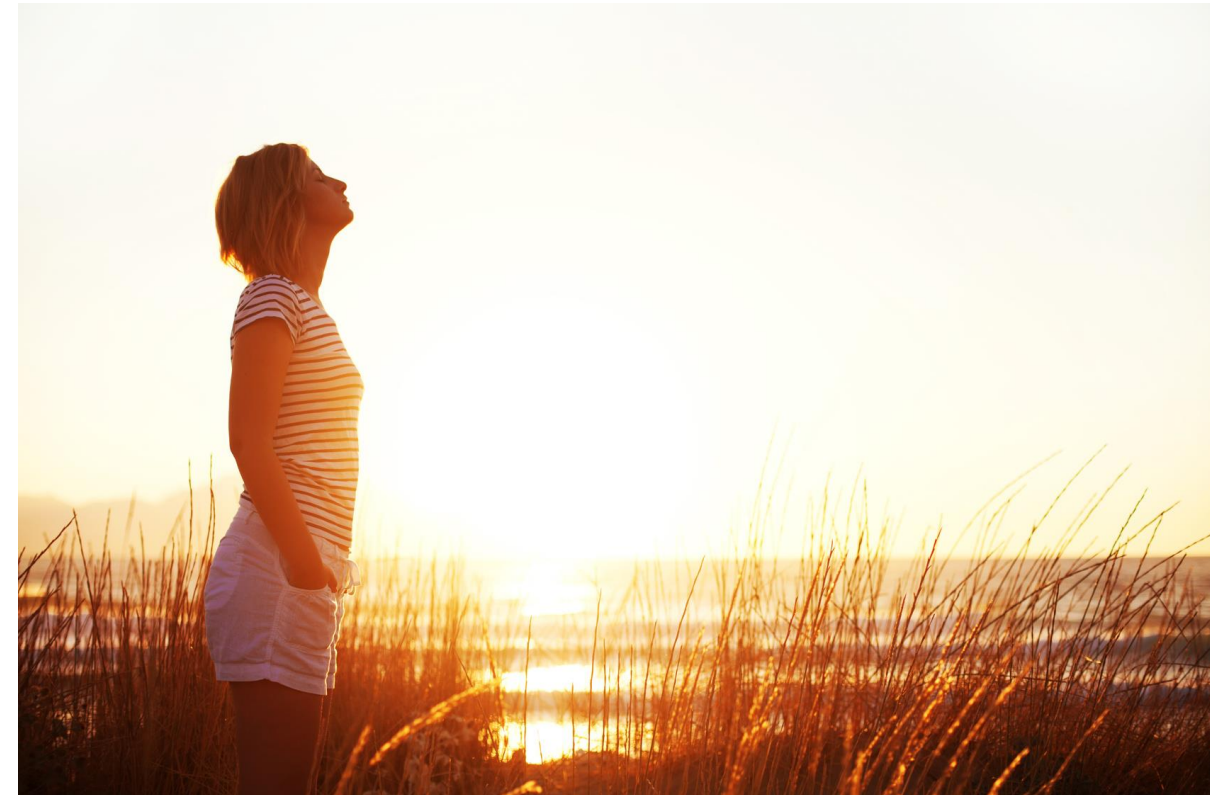
Take a deep breath