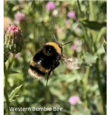
Western Bumble Bee

Coming up: Searching for funding to continue bumble bee surveys