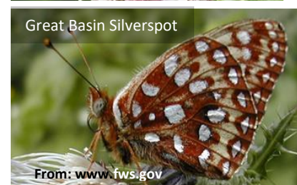
Great Basin Silverspot

Coming up: Searching for funding to continue surveys