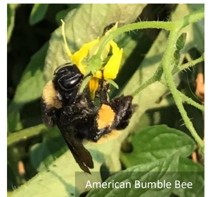
American Bumble Bee

Coming up: Searching for funding to continue bumble bee surveys