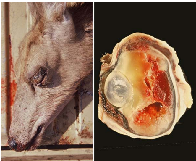
Plague panophthalmitis in a mule deer. The image on the left shows buphthalmos with exudation. The image on the right shows the sagittally sectioned globe with exudates in the anterior chamber and vitreous.