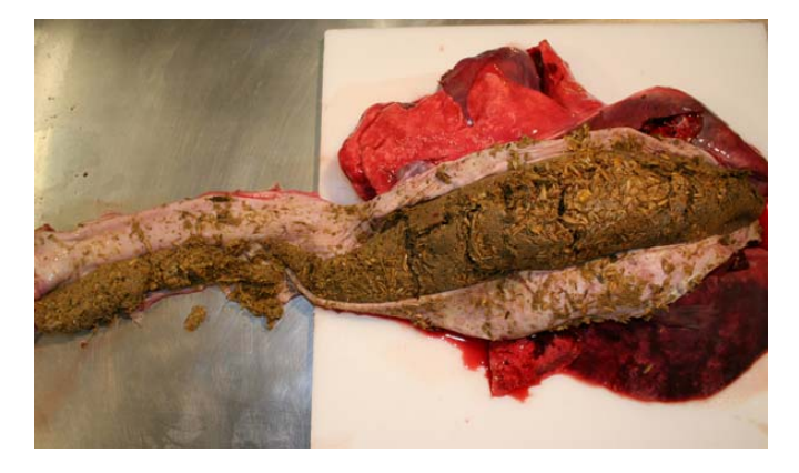
WSVL 06O16445. Removed pluck showing megaesophagus. There is abundant feed in the opened esophagus.

These changes were suggestive of abomasal emptying defect (AED) of Suffolk and Hampshire sheep. The presence of megaesophagus is unusual however.