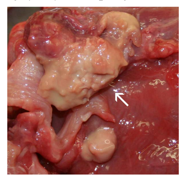
06W15341: Enlarged lymph nodes (arrowhead) from a mountain lion kitten. Histologically there was necrotizing lymphadenitis with intralesional Y . pestis.

Information on plague in cats (small domestic kind) can be found in the WSVL 2005 disease updates. http://wyovet.uwyo.edu/Diseases_2005.asp