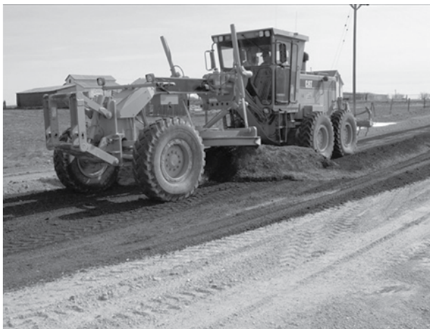
Blending RAP and virgin aggregate.

Our Recycled Asphalt Pavement (RAP) study is progressing very well. The aim of this study is to look at the effectiveness of incorporating RAP in gravel roads. As part of this experiment, the Center has been monitoring tests sections which were constructed in Laramie and Johnson Counties. In addition, the center will be working with Sweetwater County on the construction of additional test sections in the summer of 2009. Some of the preliminary findings of this interesting project will be presented at the 14 th Annual Transportation & Safety Congress in Casper.