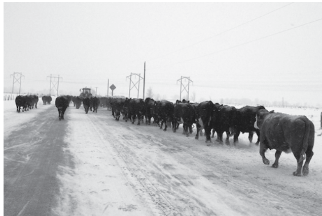
Traffic Counts are Unique in Wyoming

Office of WYDOT to get funding for eligible projects. The deadline for submitting proposals for this year is April 19 th , so you need to act fast to take advantage of this program.